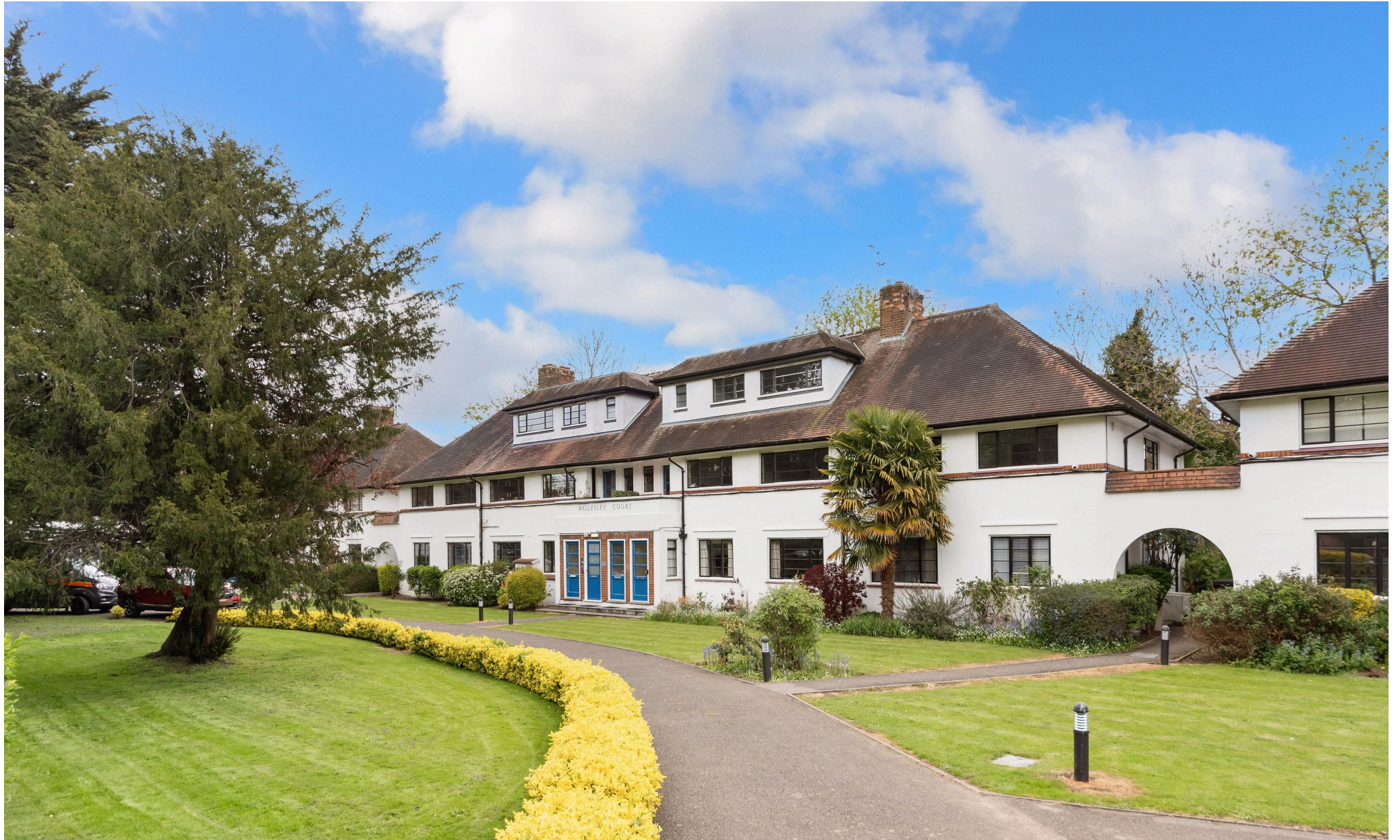
Wellesley Court, Popes Avenue TW2