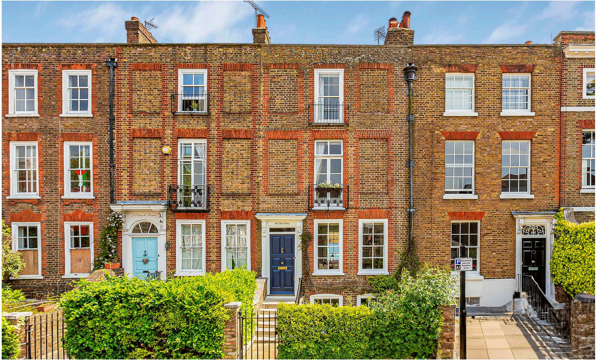
Church Terrace, Richmond TW10