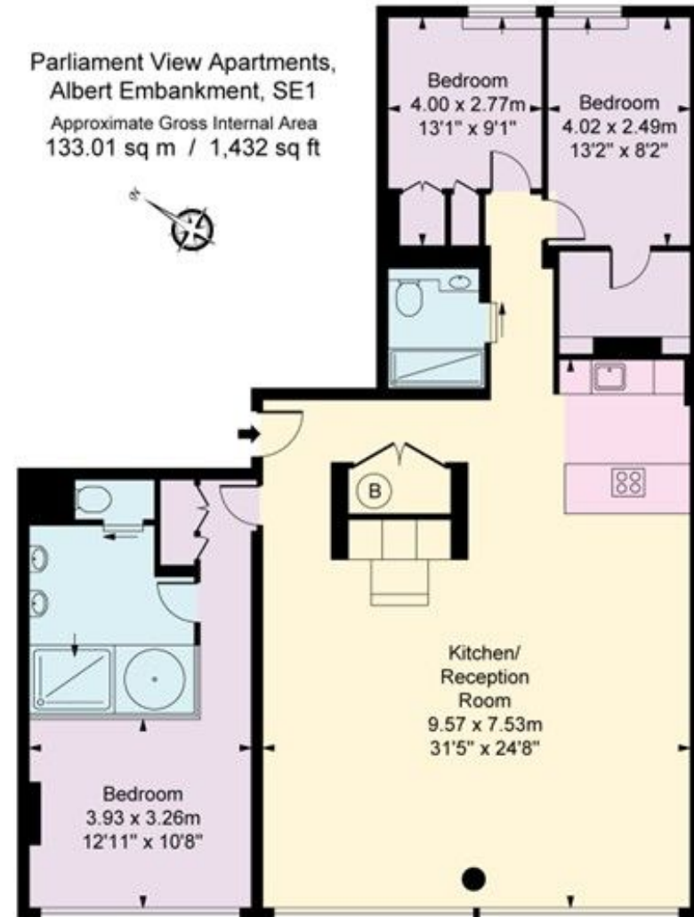
ILLUSTRATION FOR IDENTIFICATION PURPOSES ONLY ALL MEASUREMENTS ARE MAXIMUM AND INCLUDE WINDOW BAYS AND WARDROBES WHERE APPLICABLE THIS PLAN MUST NOT BE REPRODUCED BY ANY OTHER PERSON WITHOUT PERMISSION