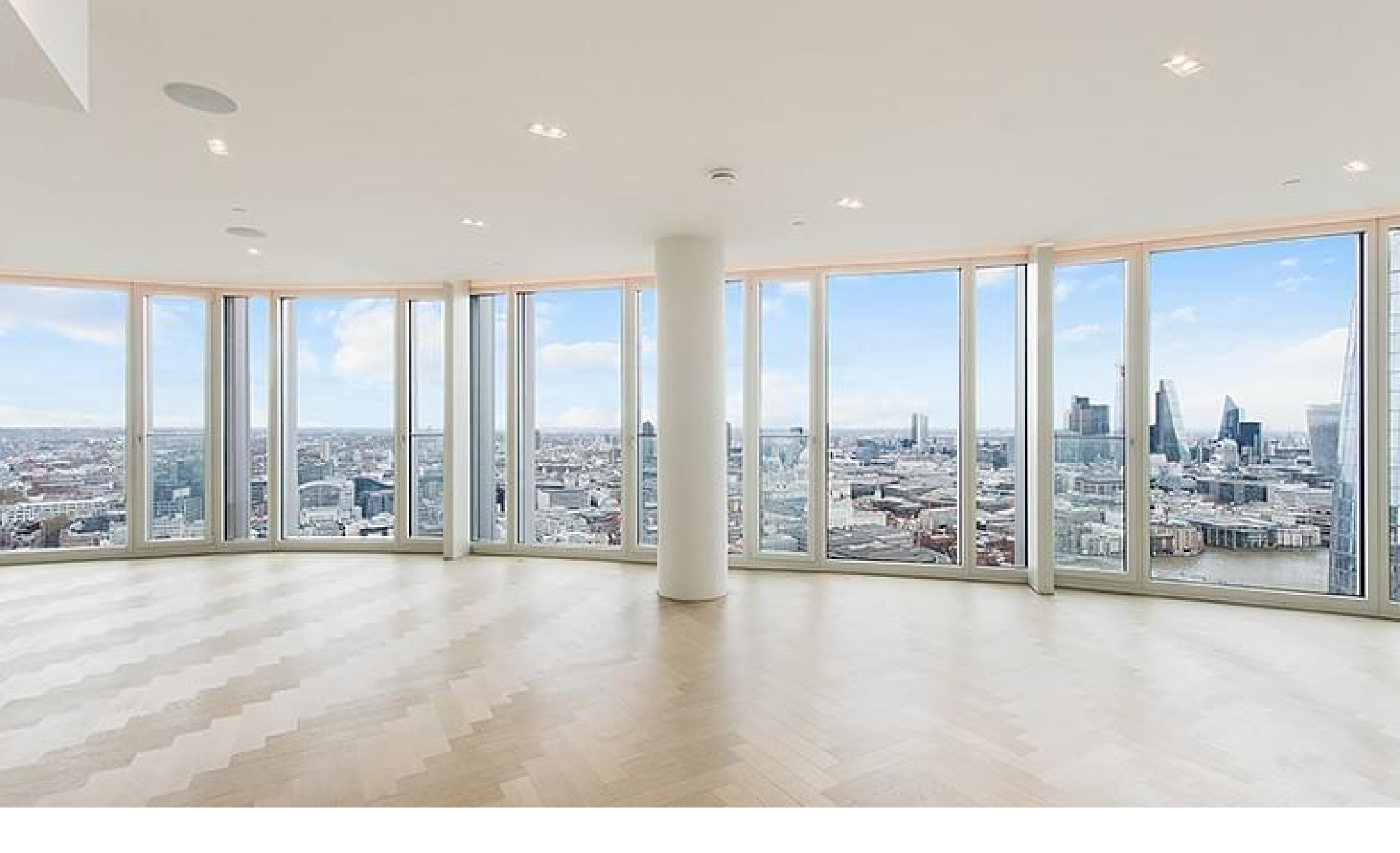
Southbank Tower, Southbank, London SE1