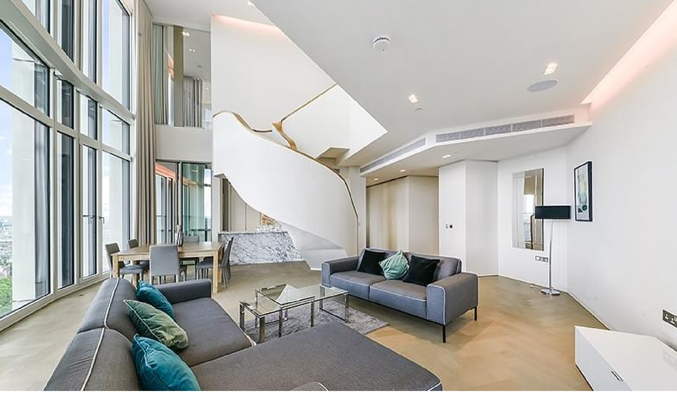
Southbank Tower, Southbank, London SE1