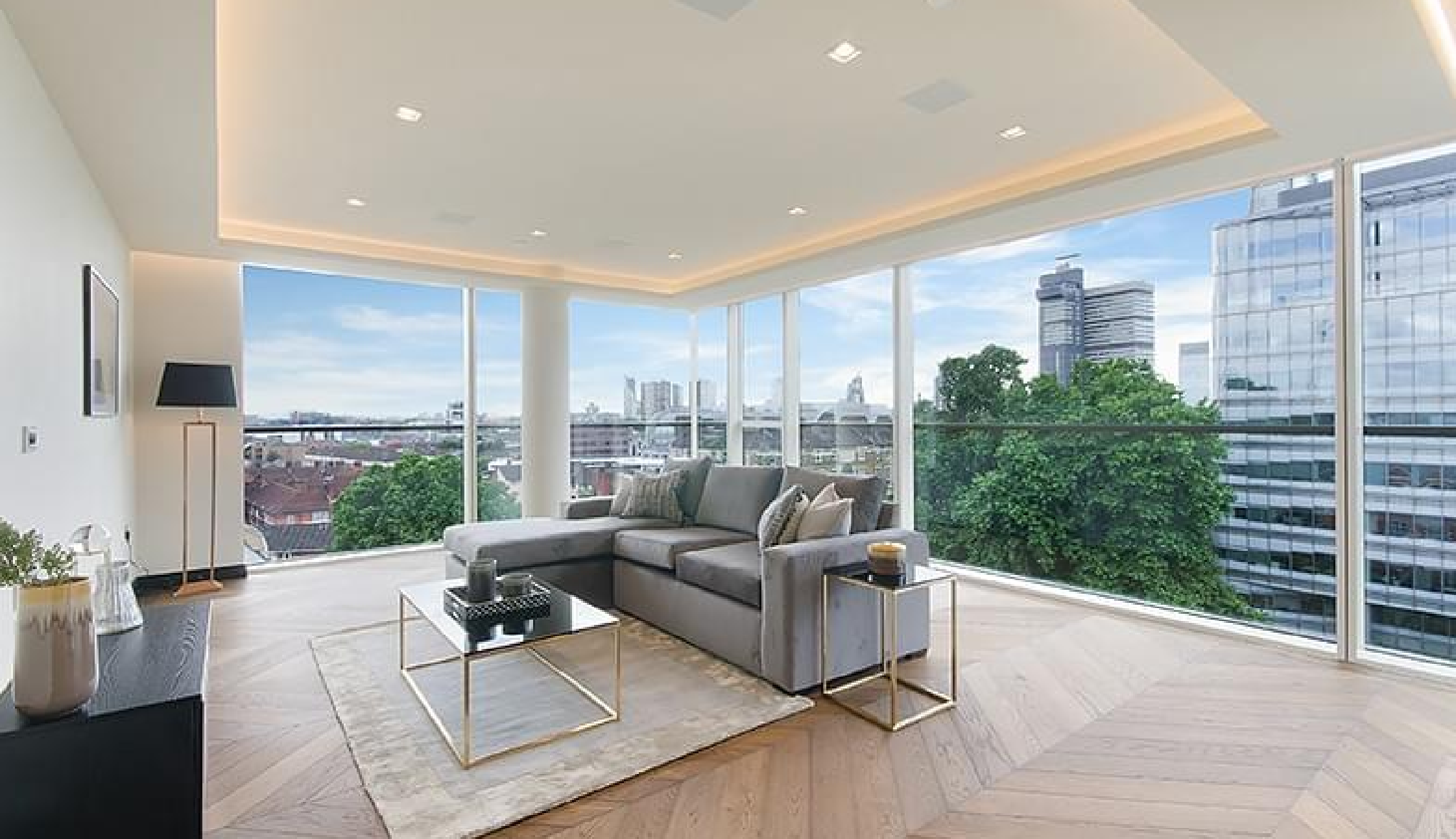
Sandringham House, Earl's Way, London SE1