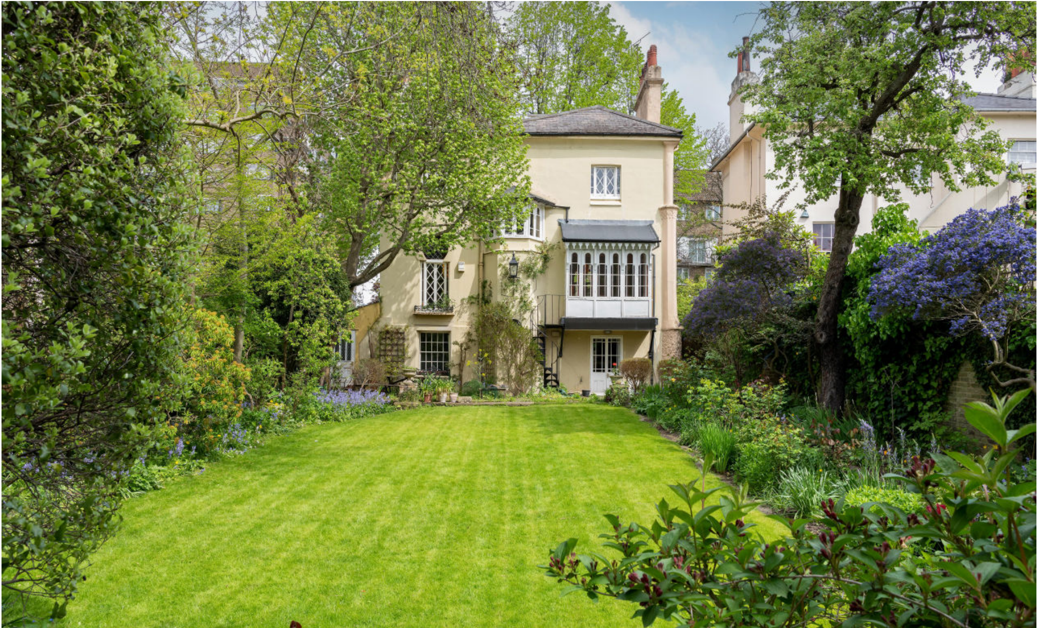
Alhambra Cottage, St John's Wood NW8