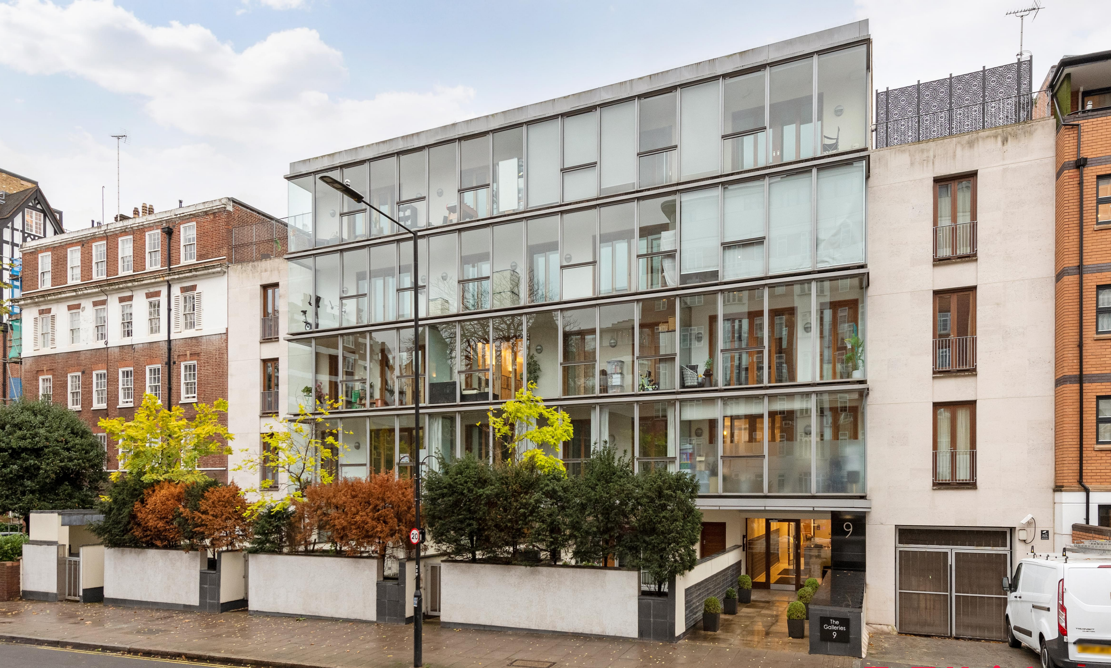
The Galleries, 9 Abbey Road, London NW8