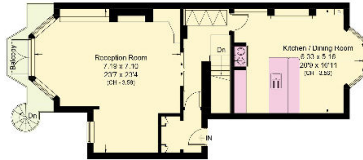
Ground Floor Approximate Area 88.9 sq m / 957 sq ft Including Limited Use Area (0.6 sq m / 6 sq ft)