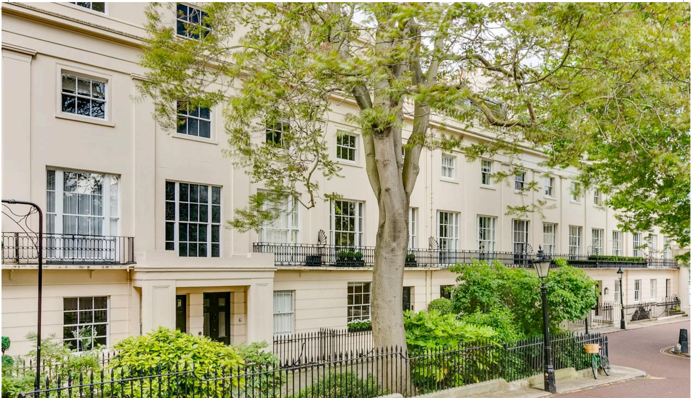
Chester Place, Regent's Park NW1