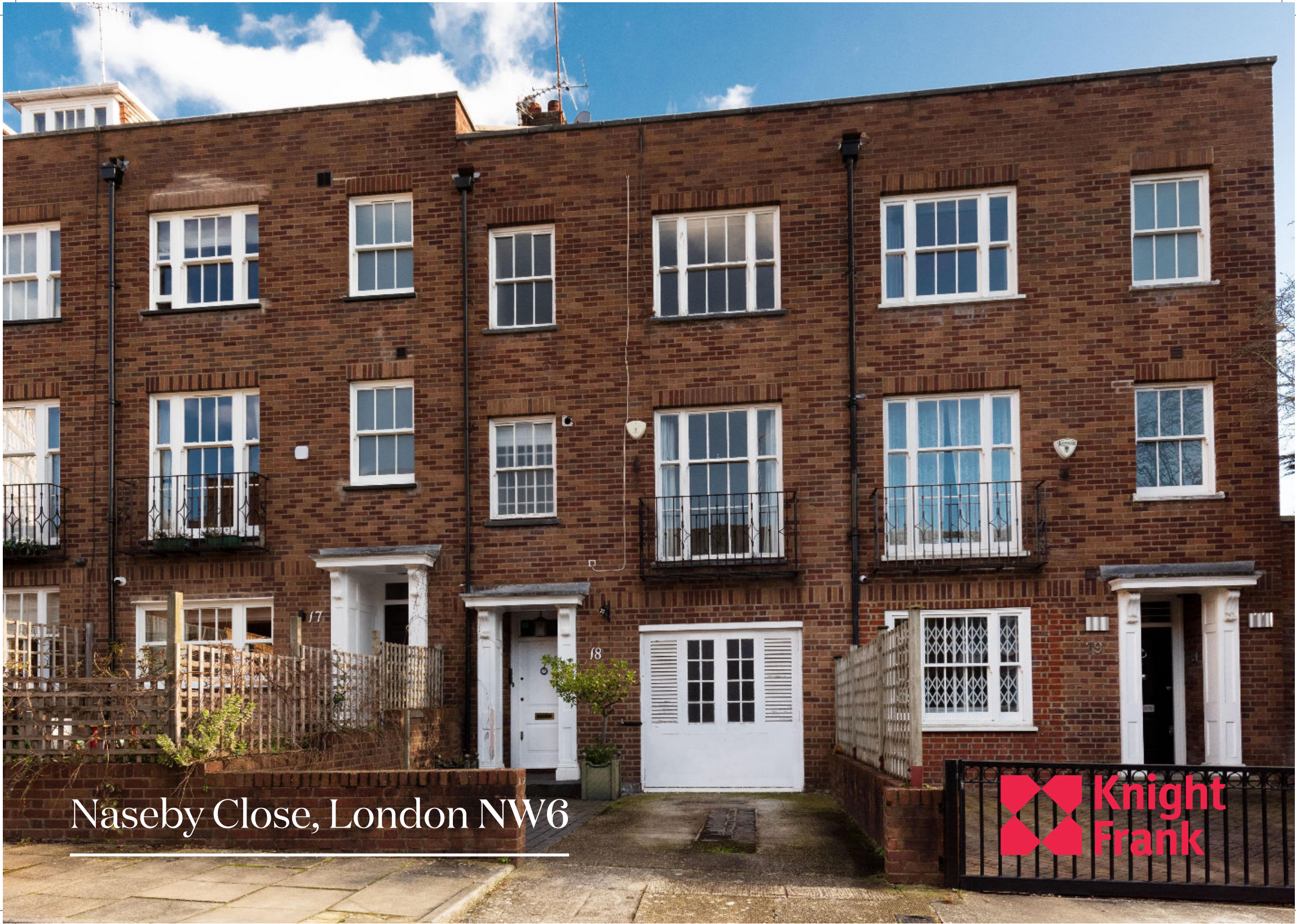
Naseby Close, London NW6