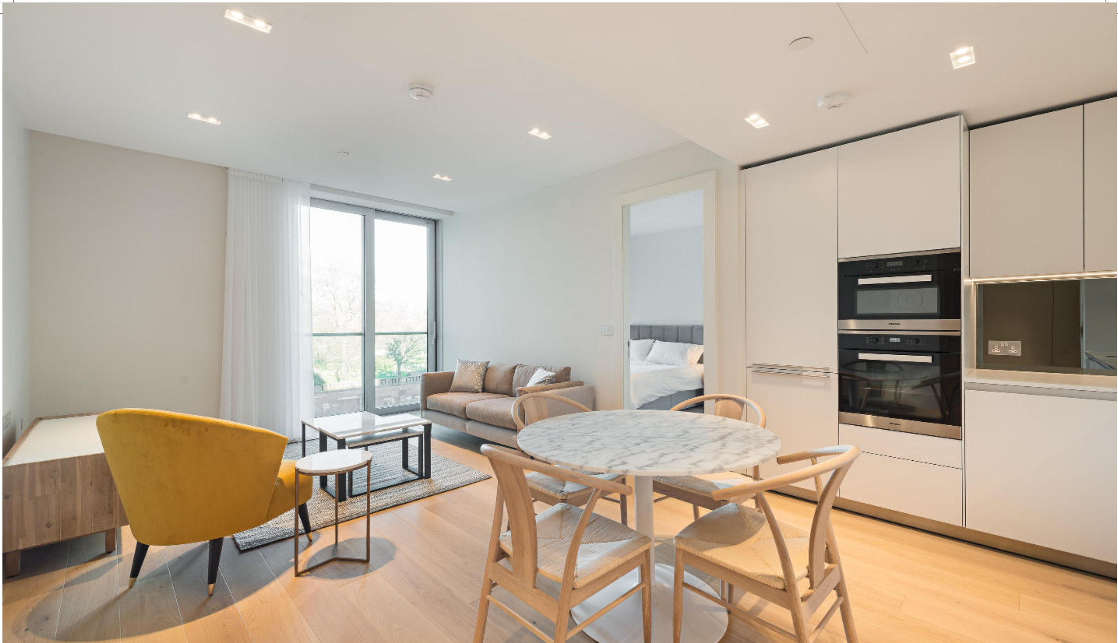
Lillie Square, Earls Court SW6