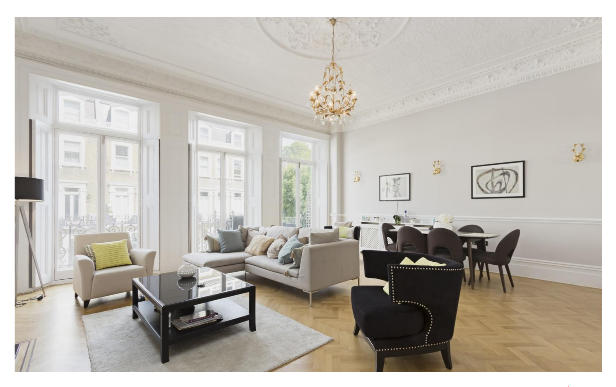
Earl's Court Square, Earl's Court SW5