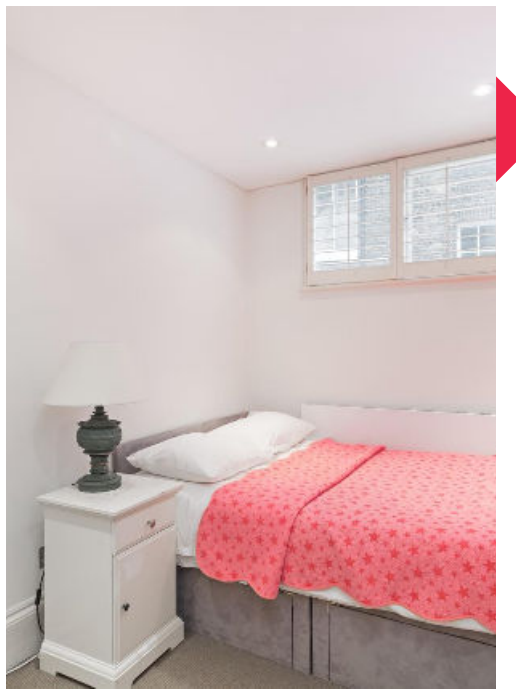
Approximately 1,899sq ft