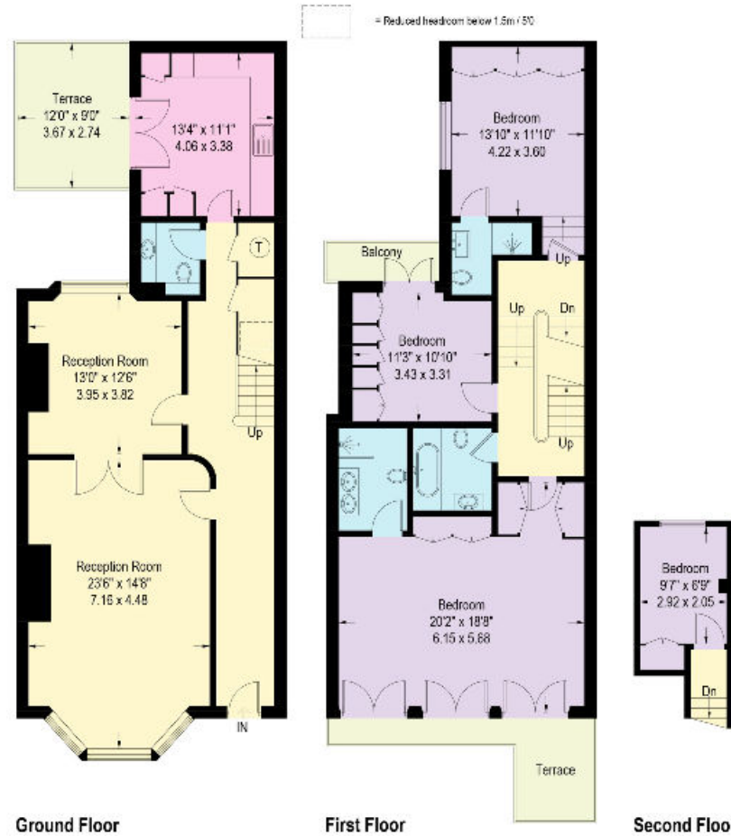
Illustration for identification purposes only, measurements are approximate, not to scale. (1D6C8812)