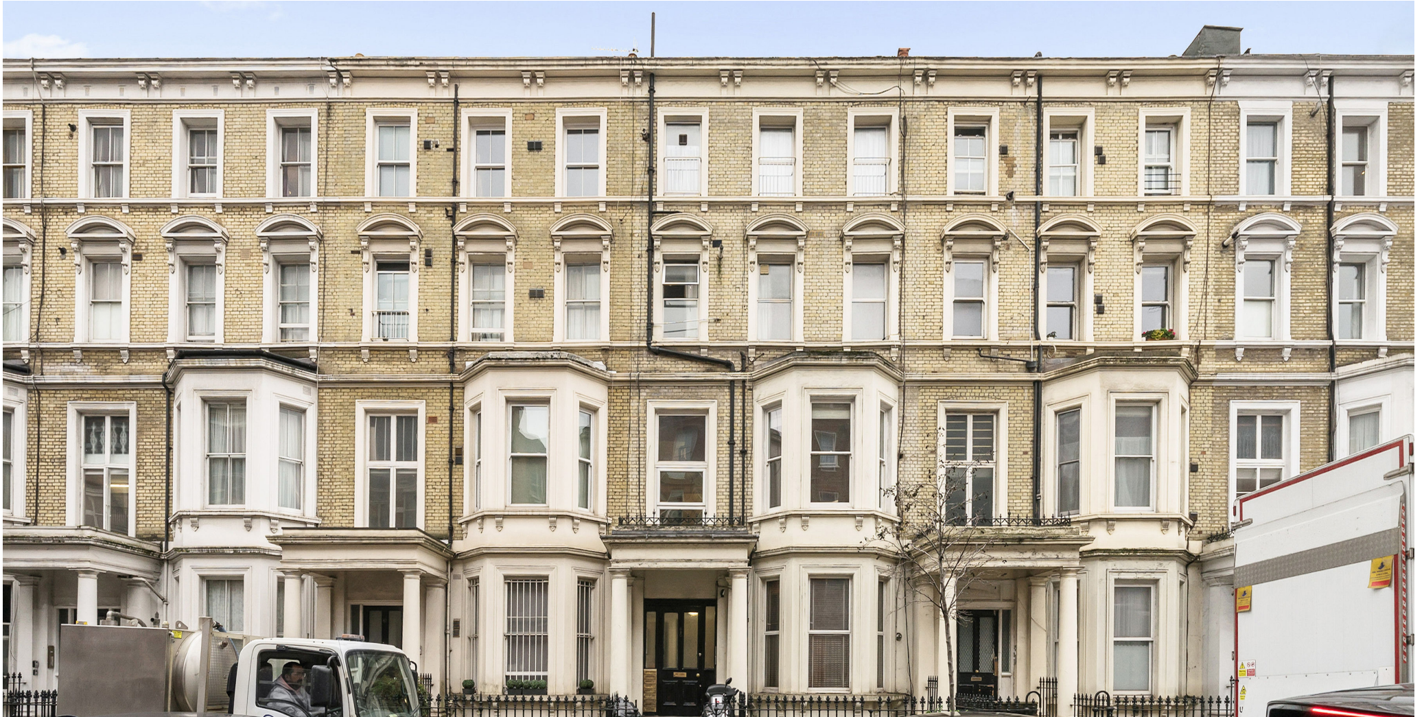
WARWICK ROAD, Earls Court SW5