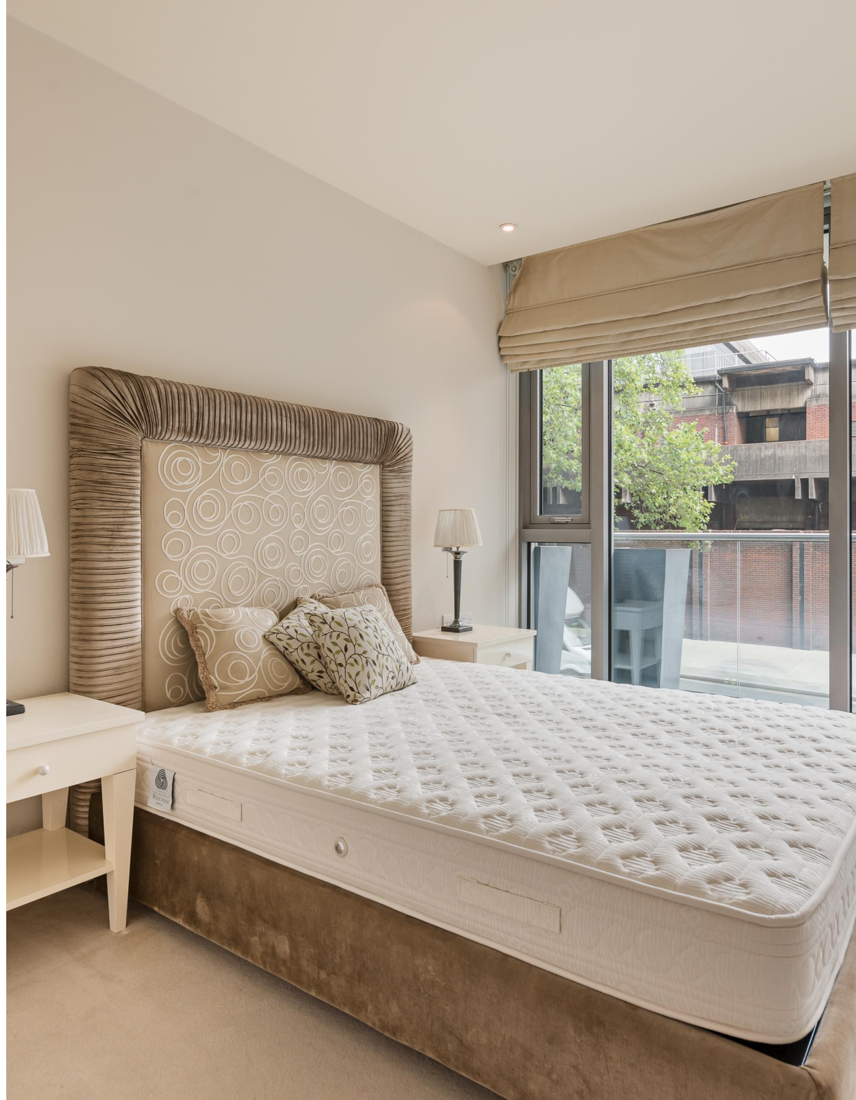
Spacious bedrooms with en suite bathrooms.