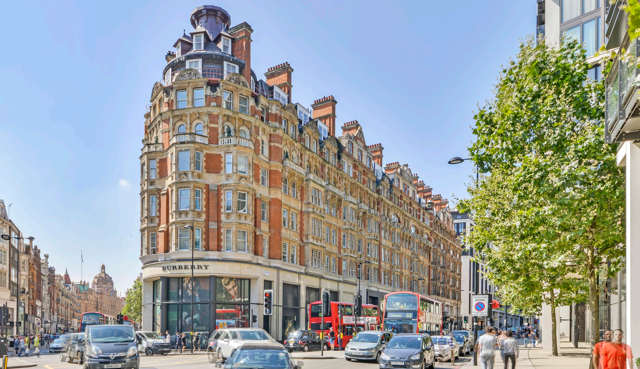
Park Mansions, Knightsbridge SW1X