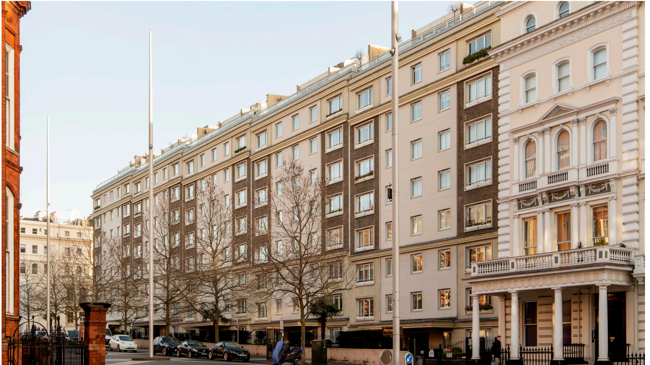
Montrose Court, Princes Gate Knightsbridge SW7