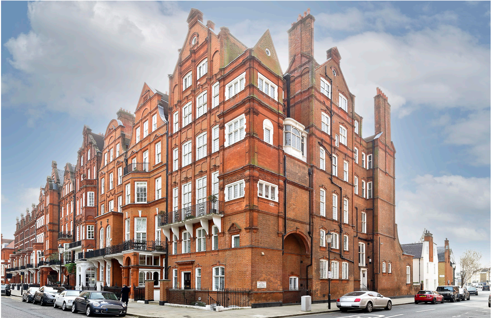
Cadogan Square, Knightsbridge SW1X