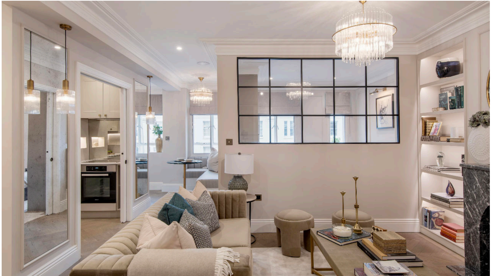
Whitelands House, Cheltenham Terrace, Chelsea SW3