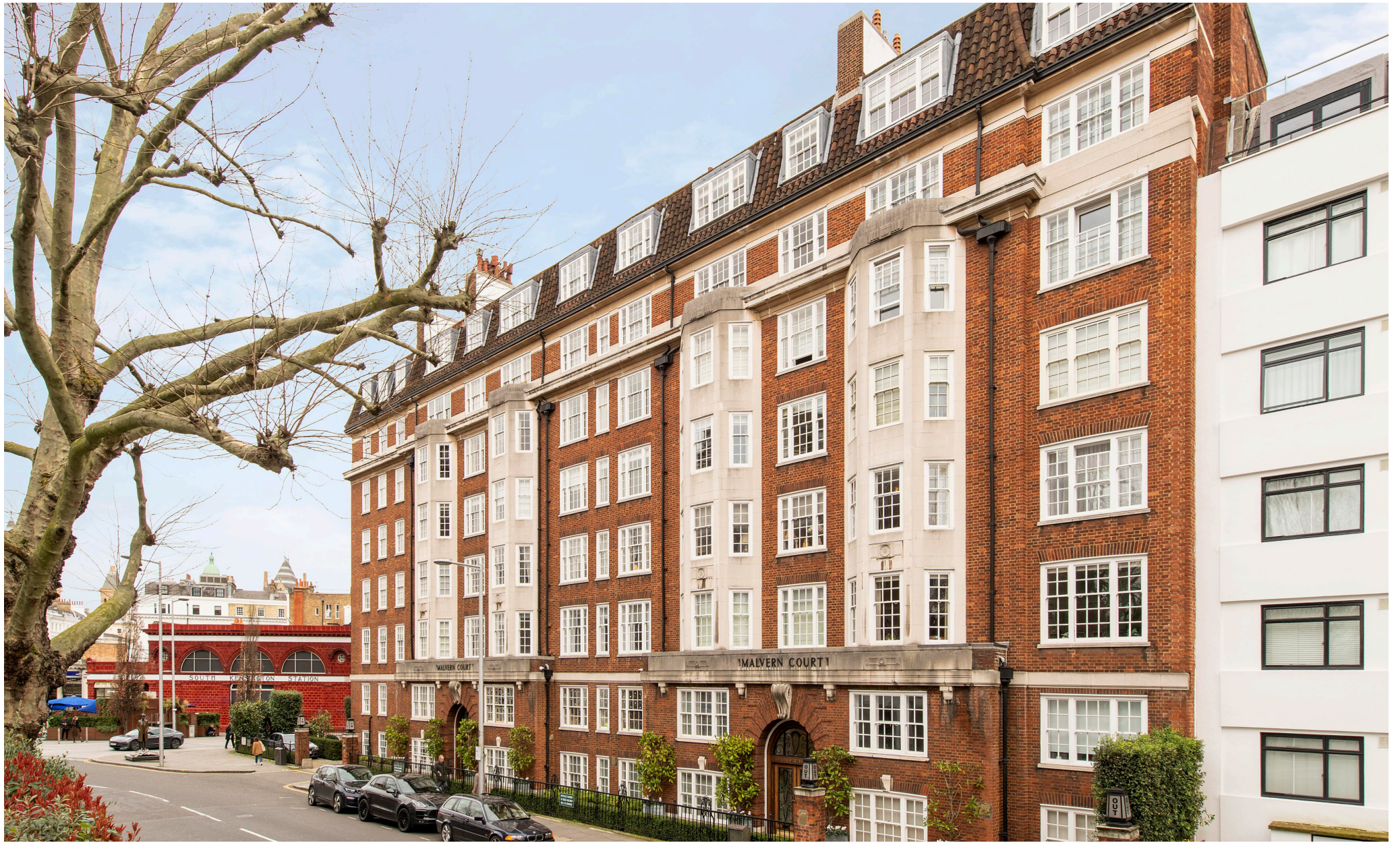
Malvern Court, Onslow Square, London SW7