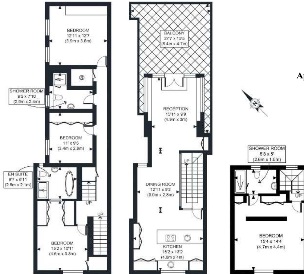
FIRST FLOOR GROSS INTERNAL FLOOR AREA 783 SQ FT