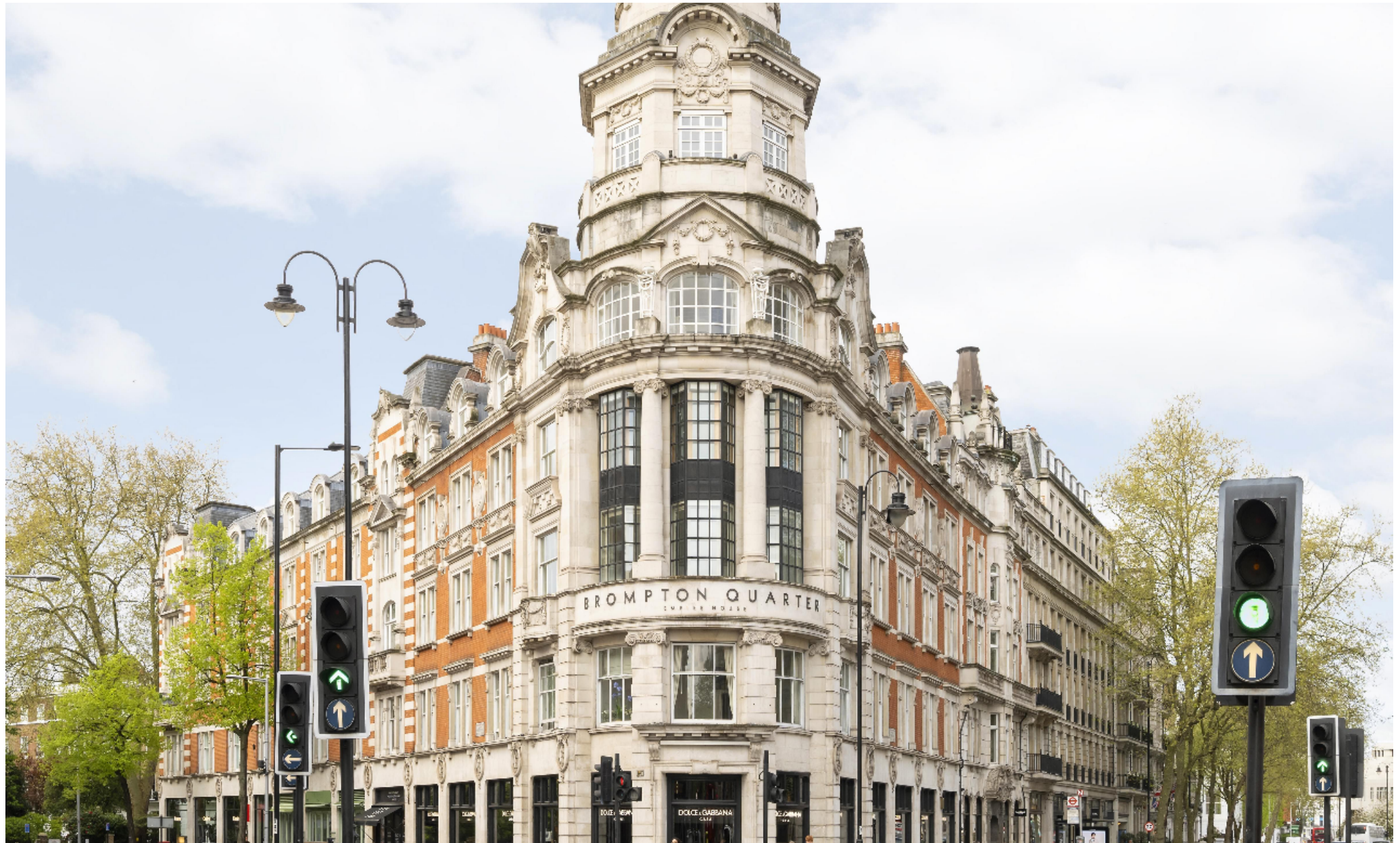
Empire House, South Kensington SW7