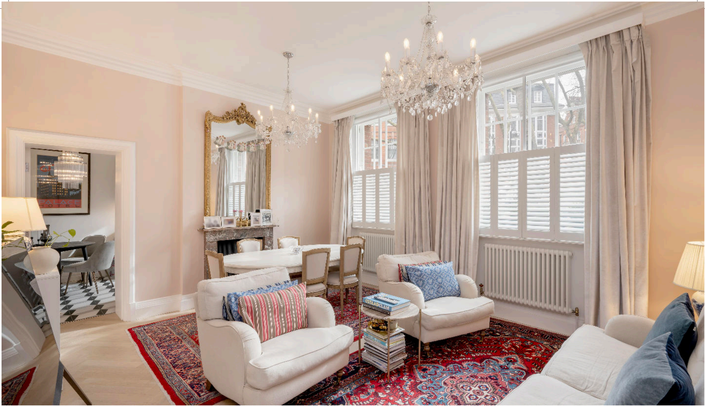
Cadogan Gardens, London SW3