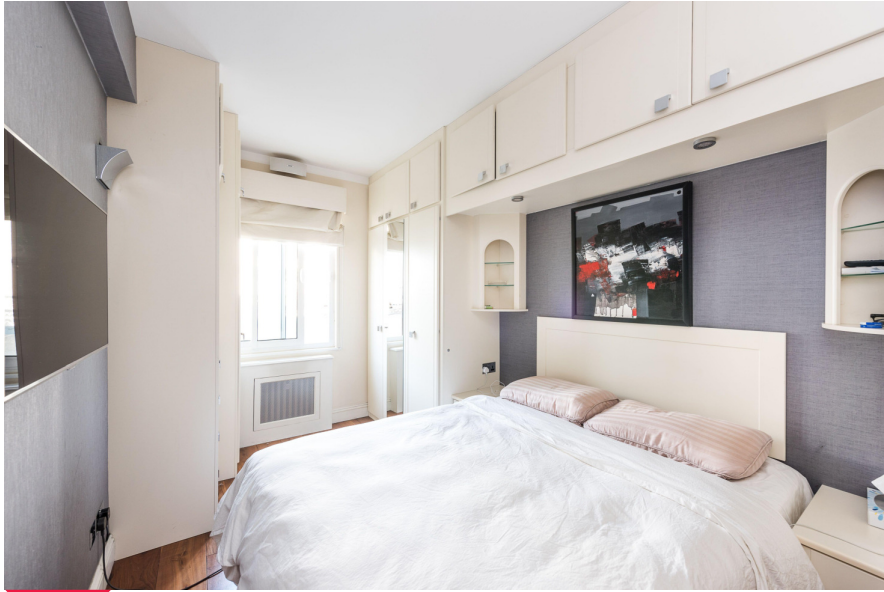
Built-in storage throughout