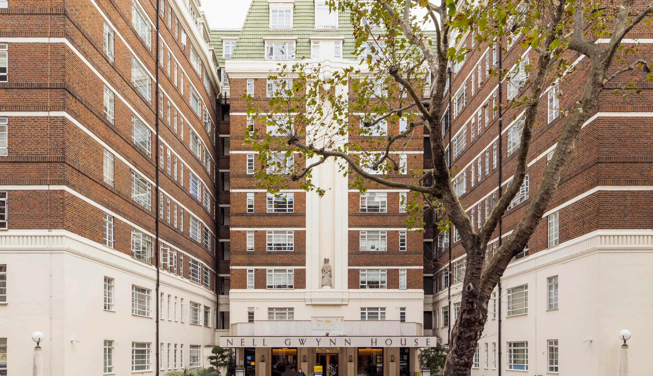
Nell Gwynn House, Sloane Avenue, Chelsea SW3