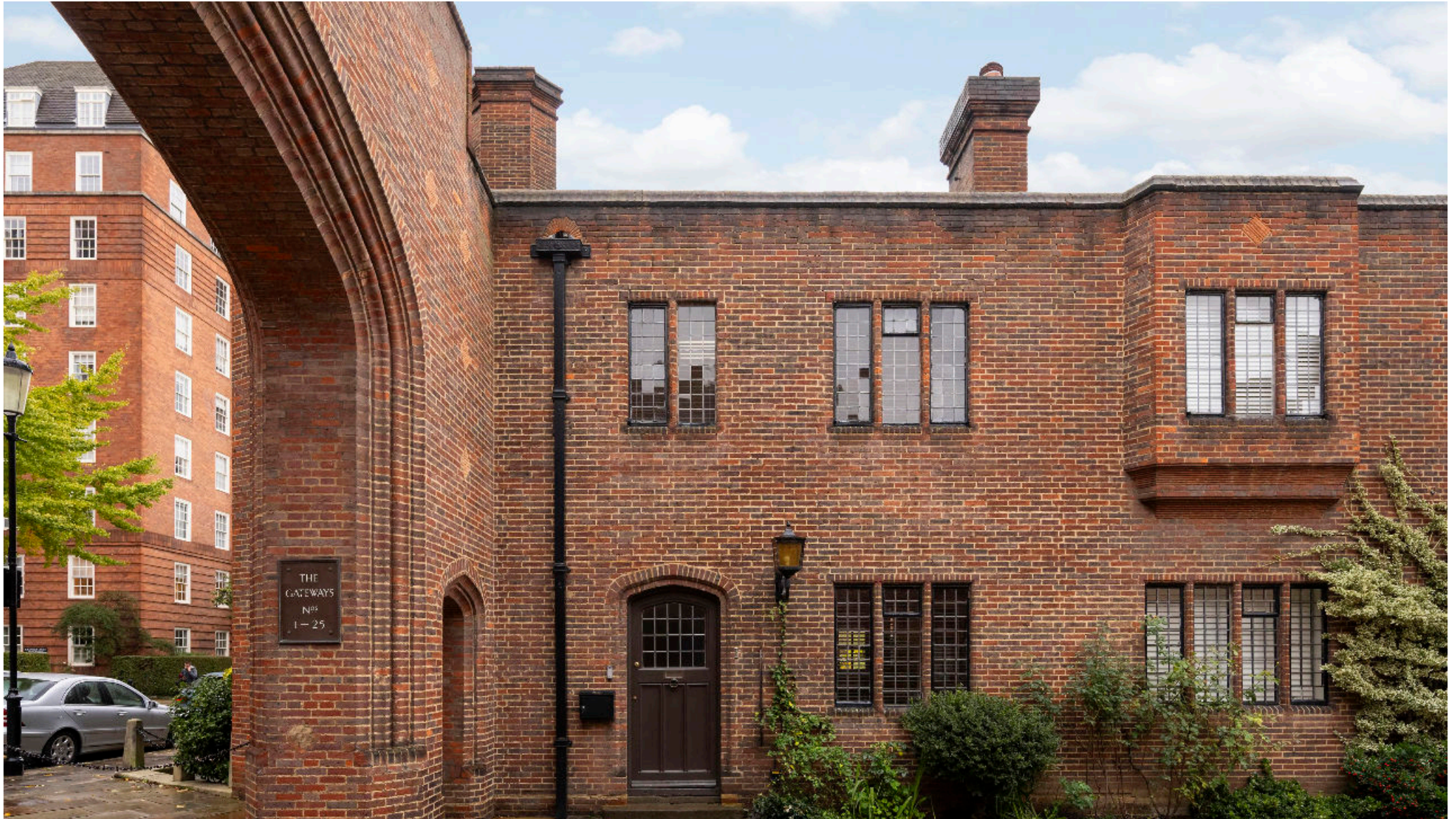
The Gateways, Sprimont Place Chelsea SW3