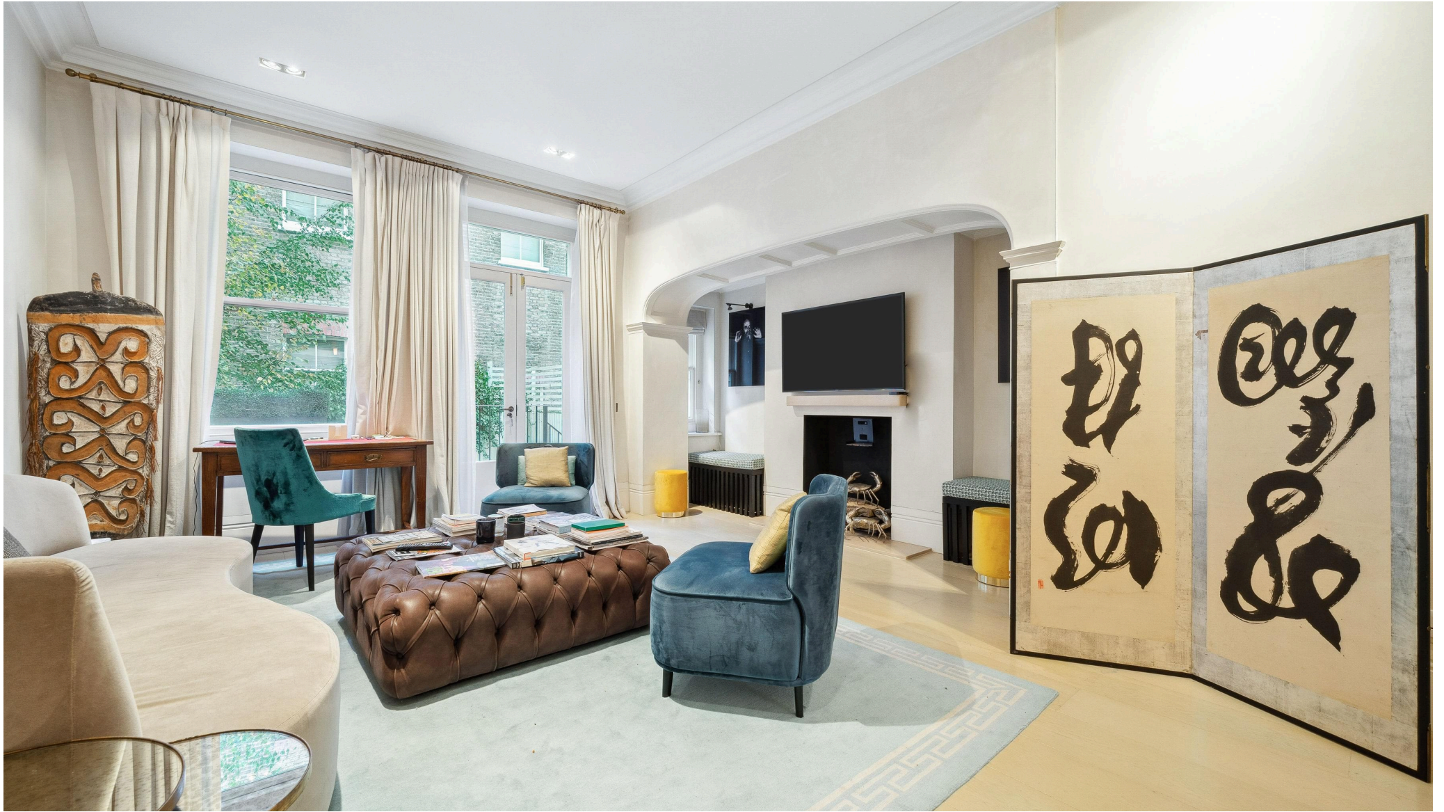
Waveney House, Ormonde Gate Chelsea SW3