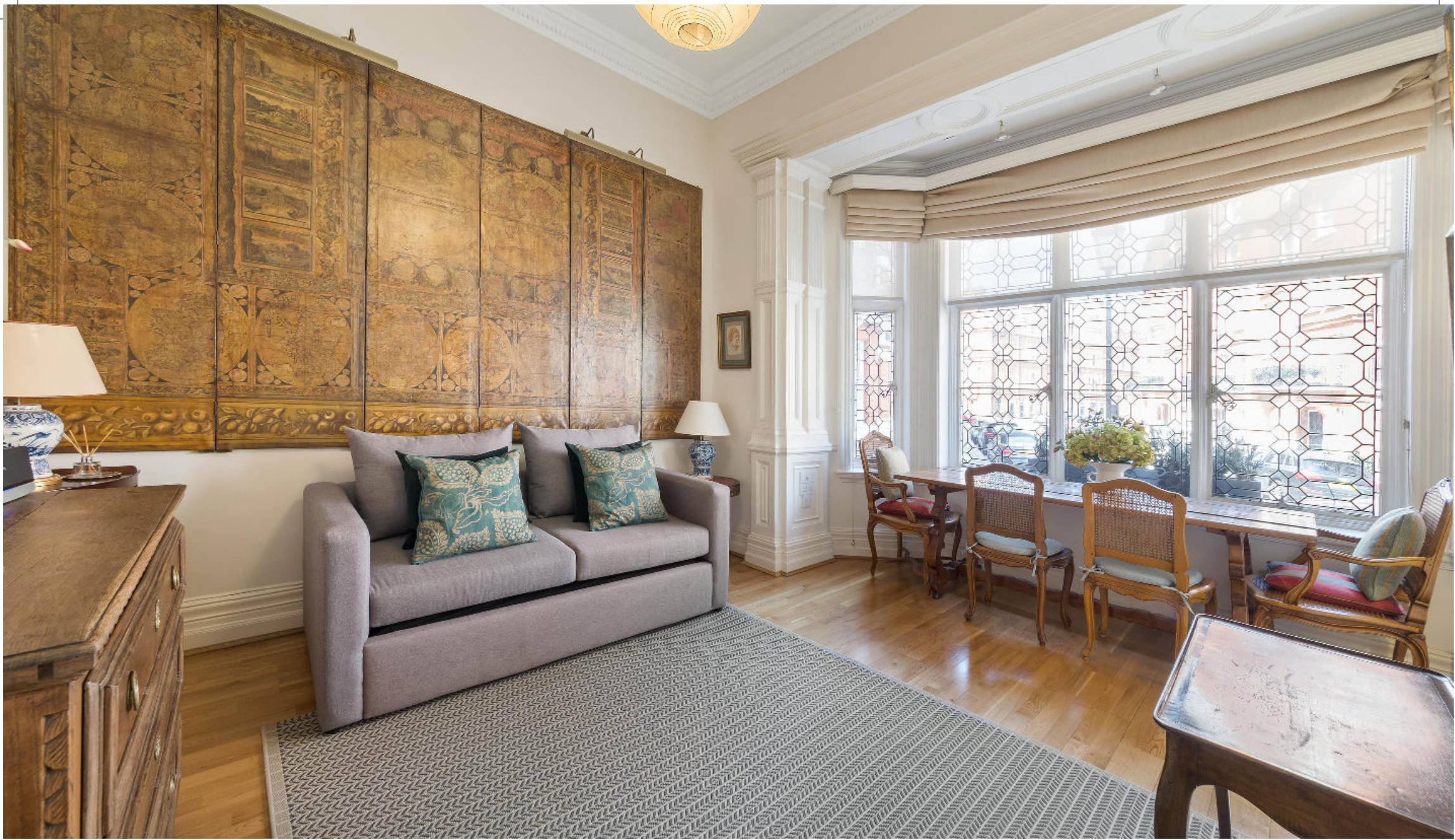
Egerton Gardens, London SW3