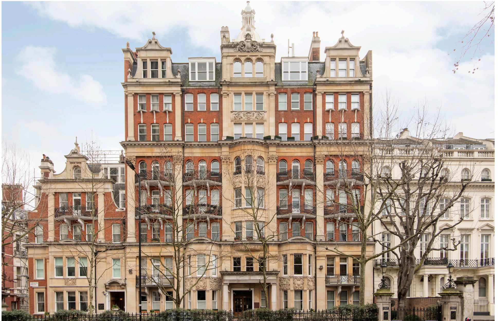
Rutland Court, Kensington Road SW7