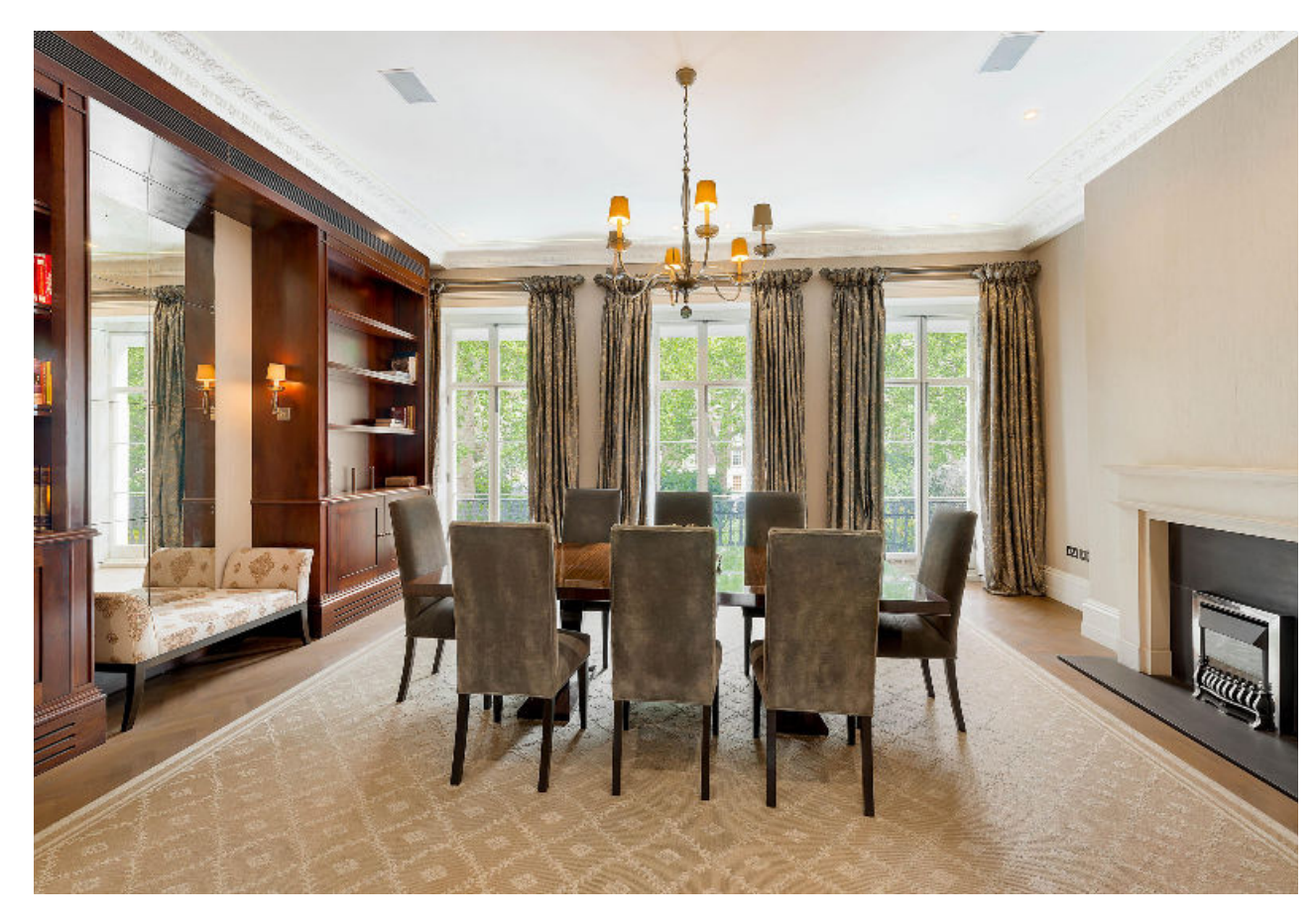
Price on Application

Leasehold: approximately 37 years remaining