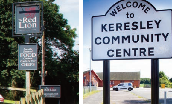
Keresley, Coventry and surrounding area photography