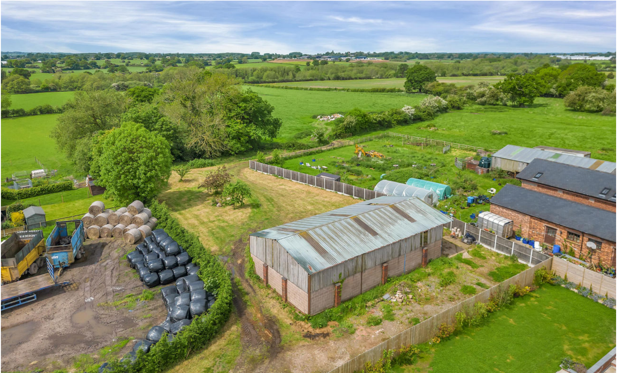
The Barn at Levedale Farm, Levedale, Staffordshire