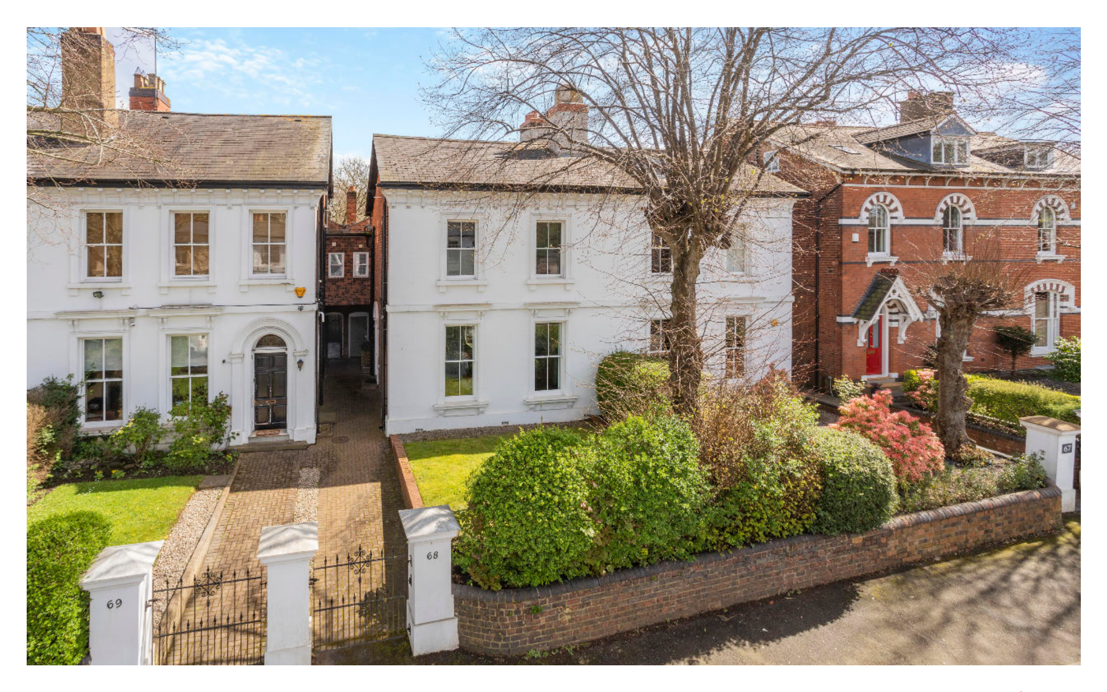
Wheeleys Road, Edgbaston, Birmingham