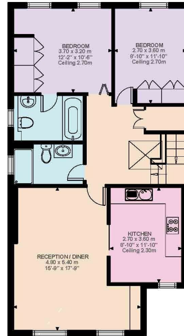
Third Floor 834 ft 2

This plan is for guidance only and must not be relied upon as a statement of fact. Attention is drawn to the important notice on the last page of the text of the Particulars.