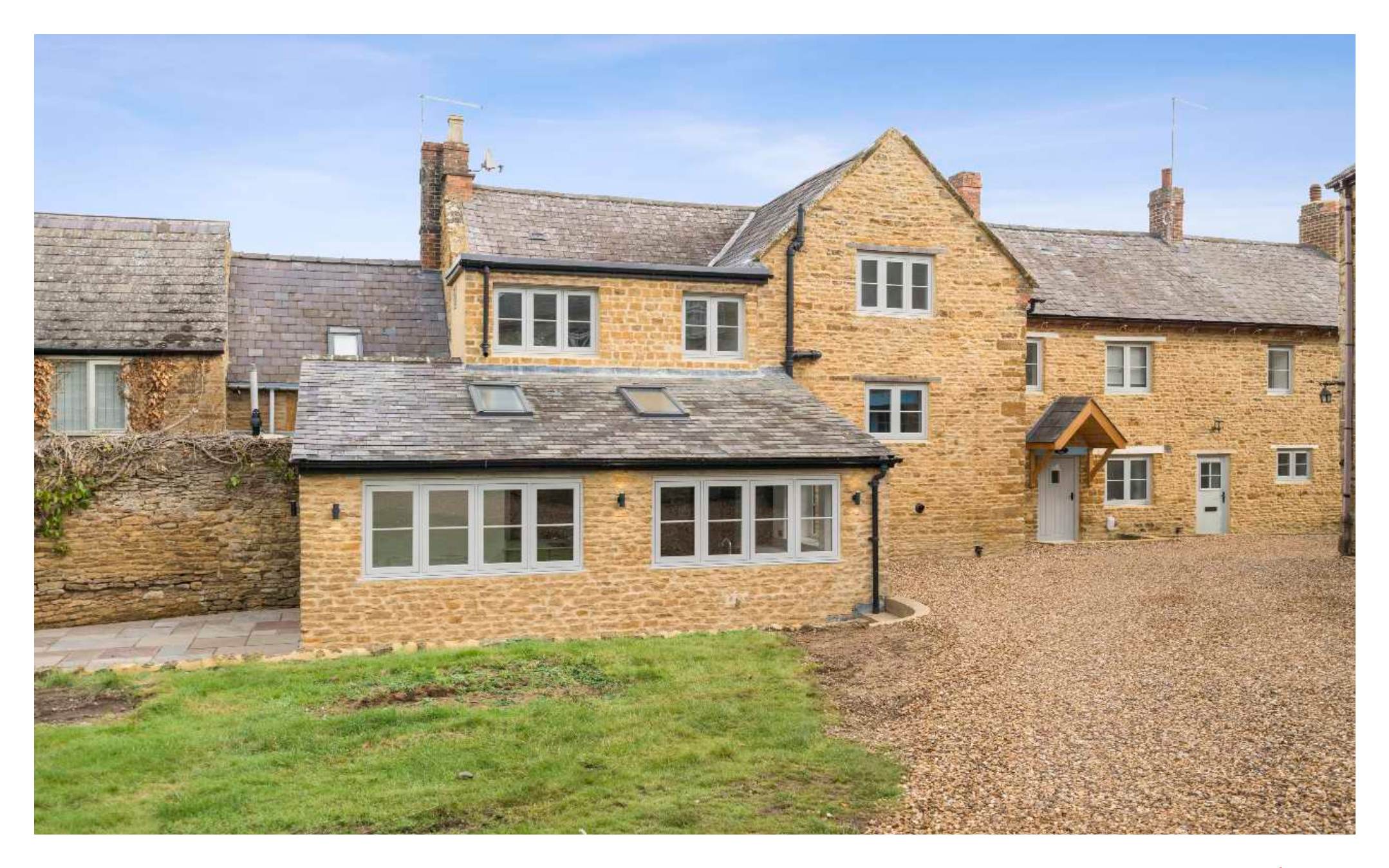
The Old House, Church Street, Boughton