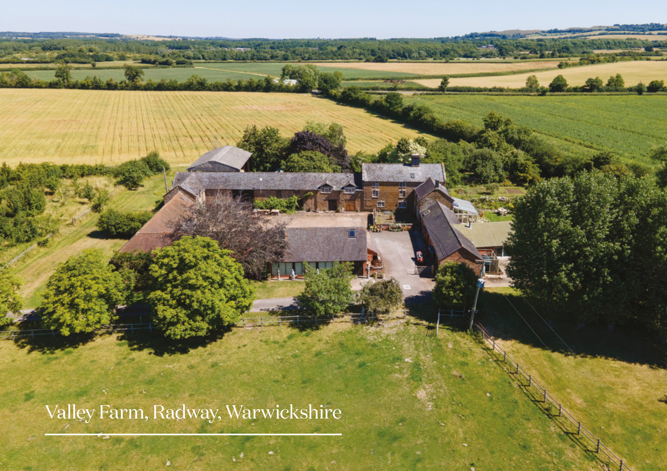
Valley Farm, Radway, Warwickshire