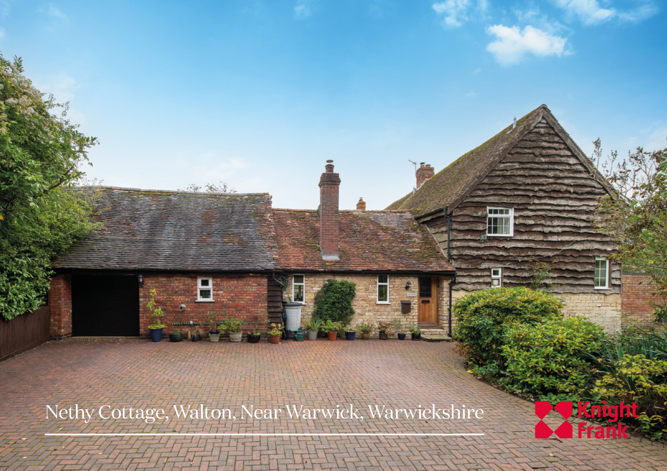
Nethy Cottage, Walton, Near Warwick, Warwickshire