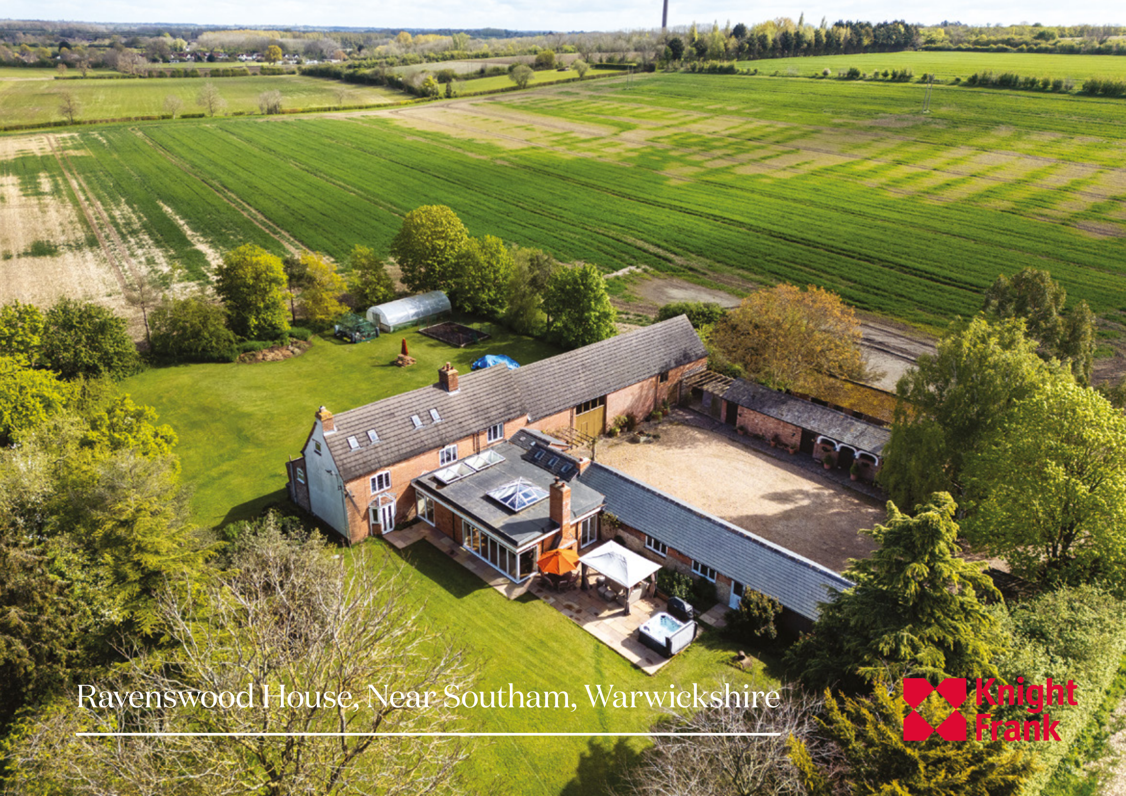
Ravenswood House, Near Southam, Warwickshire