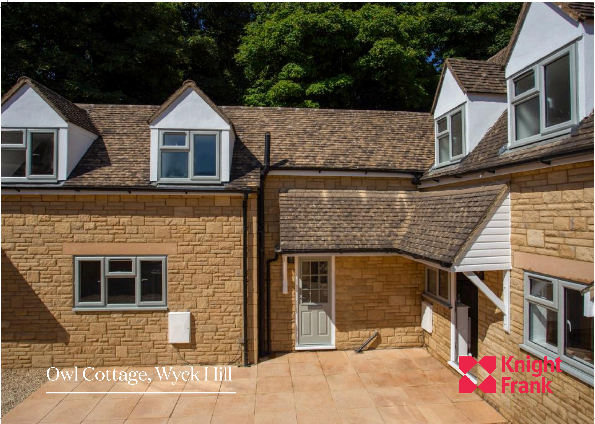
Owl Cottage, Wyck Hill