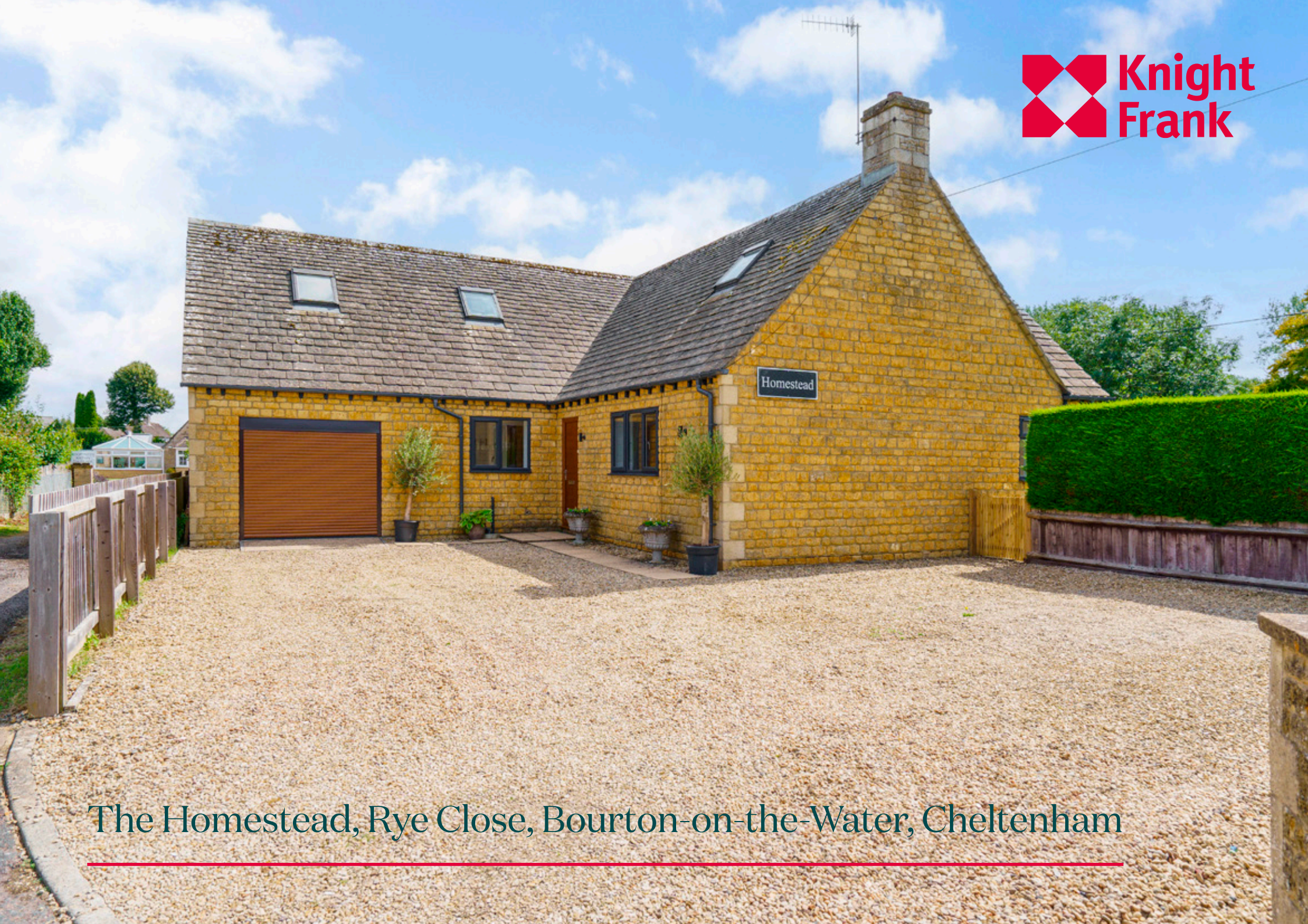
The Homestead, Rye Close, Bourton-on-the-Water, Cheltenham