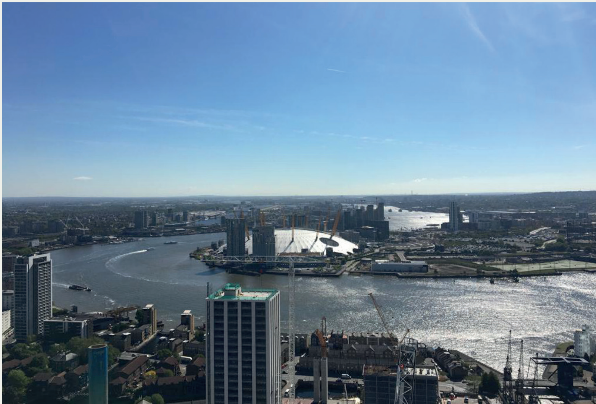
/ View from 10 Park Drive, Apartment 4001 looking East towards Wood Wharf and The O2, taken May 2019