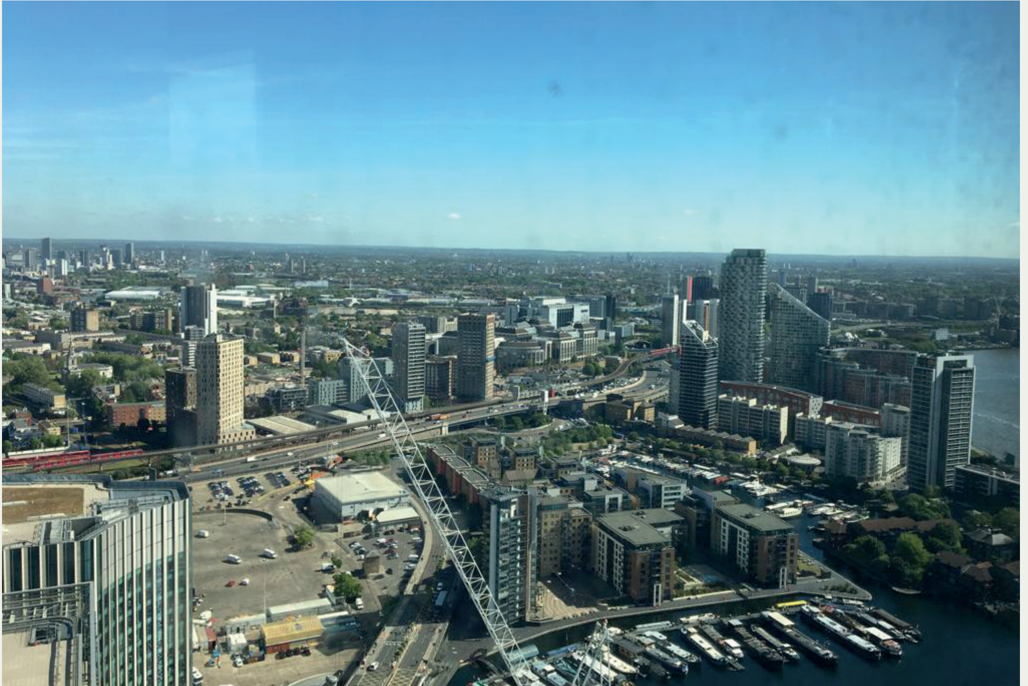
/ View from 10 Park Drive, Apartment 3906 looking North East towards Blackwall, taken May 2019