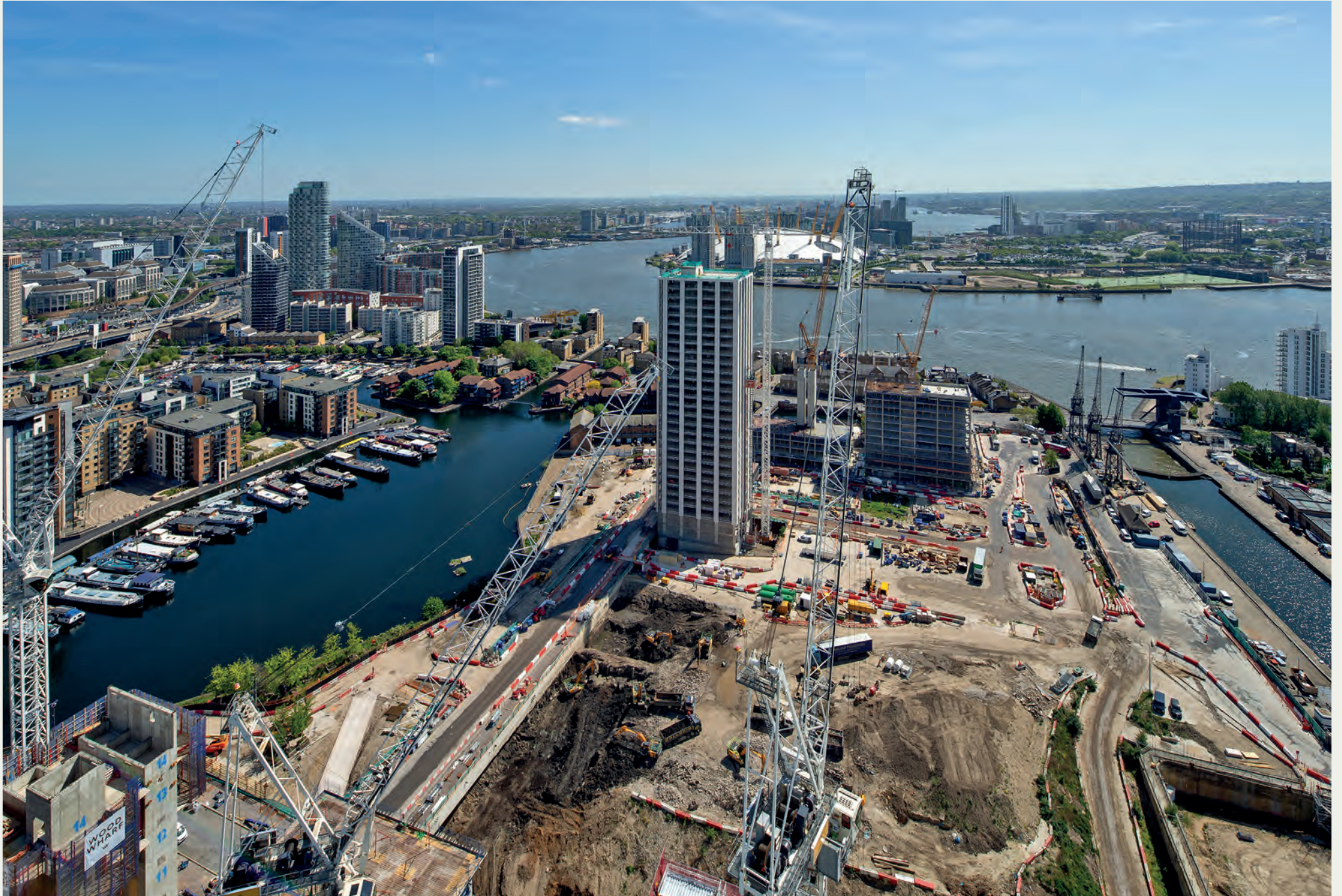
/ View from 10 Park Drive, Apartment 3406 looking North East towards Wood Wharf, The O2 and Blackwall, taken May 2019