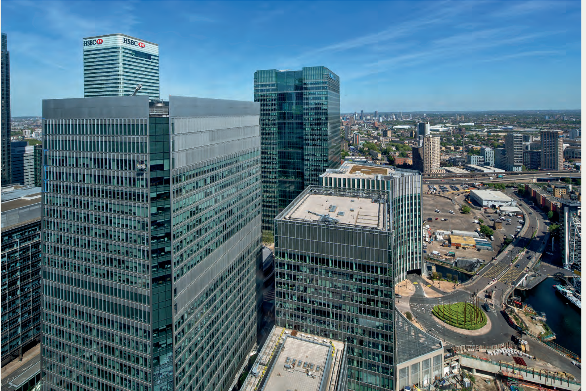
/ View from 10 Park Drive, Apartment 3406 looking North towards Canary Wharf, taken May 2019