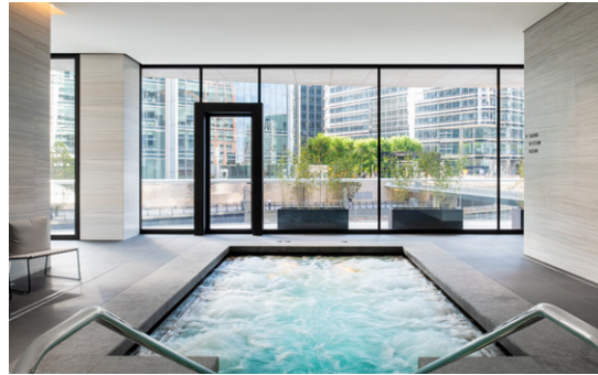
Residents' pool area on the first floor