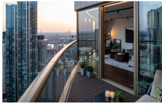
The terraces of the Bay apartments