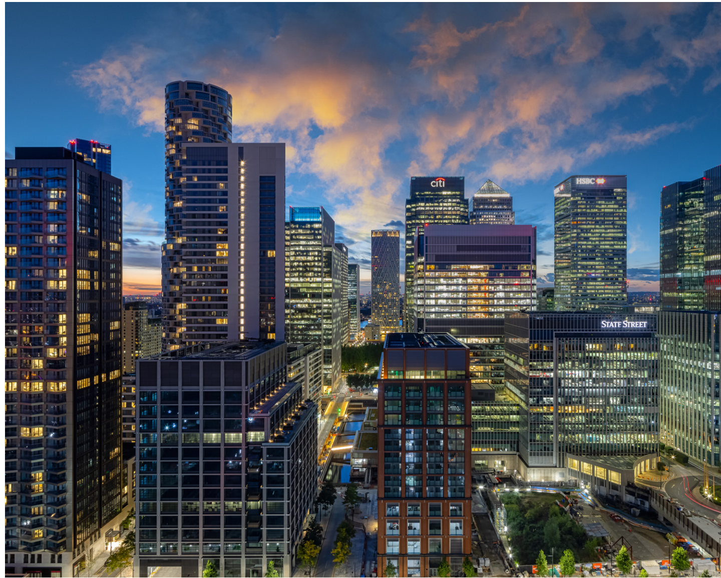
Canary Wharf's 128 acre private Estate

One Park Drive will be both a symbol and the heart of Canary Wharf's New District, an extension of a dynamic global community and the start of a new vibrant neighbourhood.