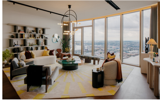
Level 55 living area