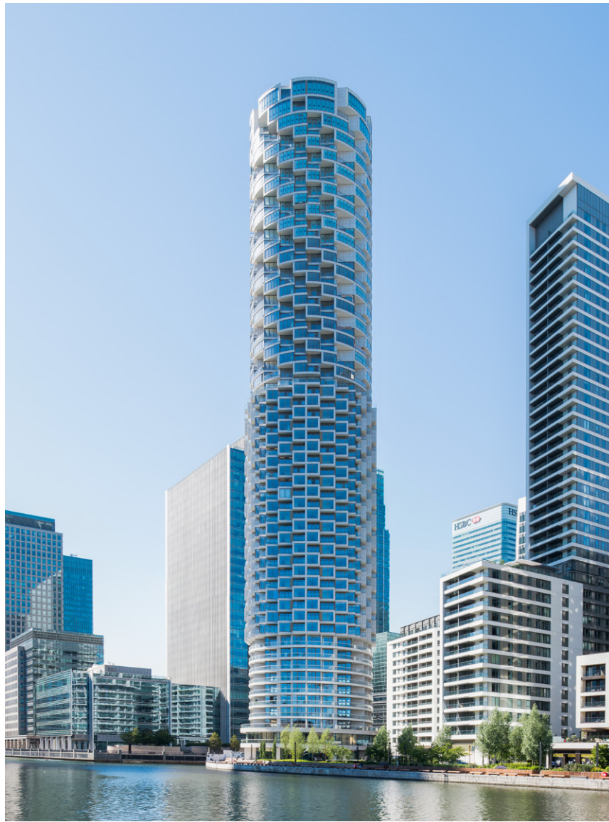
One Park Drive, Canary Wharf – Herzog & de Meuron's first residential building in the UK