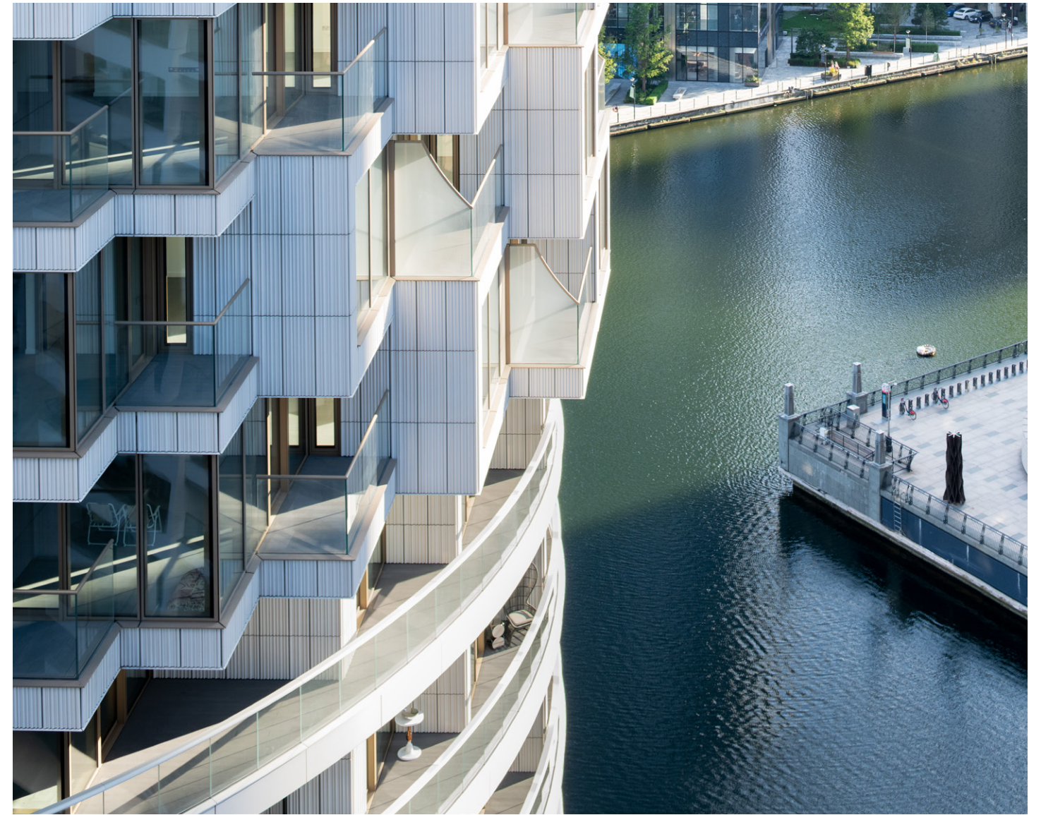
Loft and Cluster apartments overlooking South Dock

Being one organisation that does everything, from creating the initial vision, through construction, to the day-to-day management, gives the Group a uniquely long-term perspective.