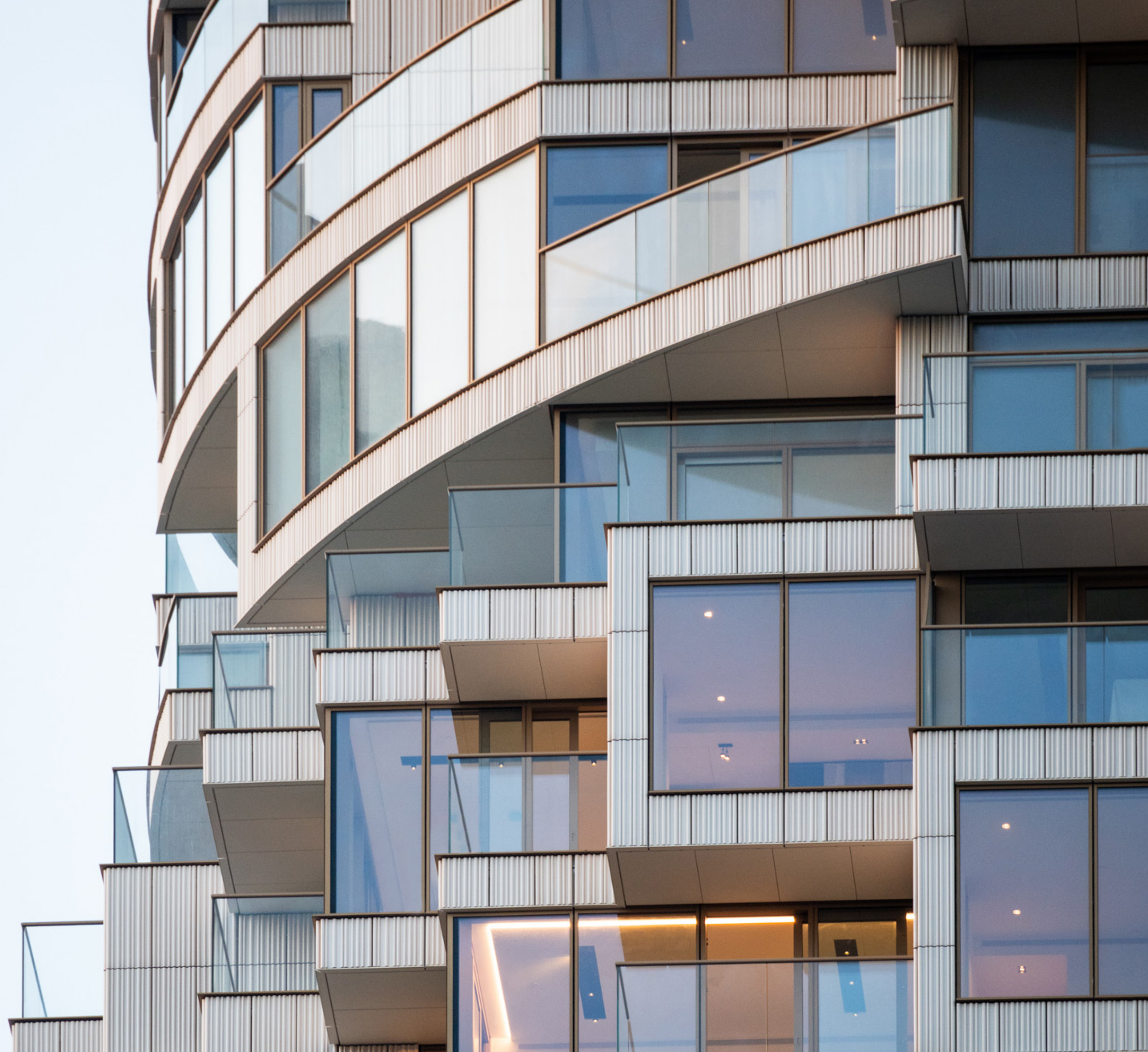
One Park Drive Cluster and Bay apartments