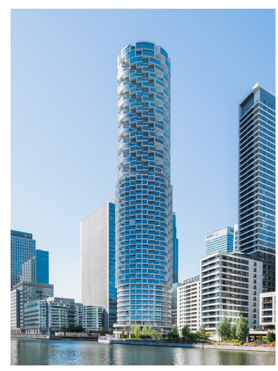
One Park Drive, Canary Wharf - Herzog & de Meuron's first residential building in the UK