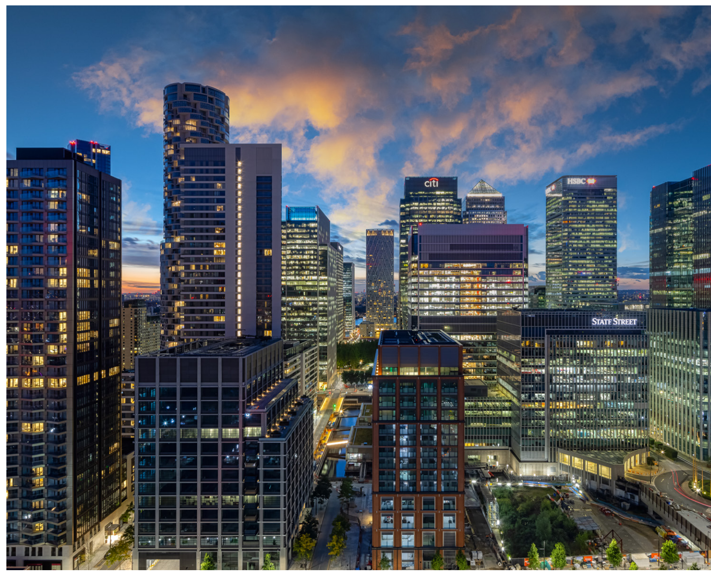
Canary Wharf's 128 acre private Estate

One Park Drive will be both a symbol and the heart of Canary Wharf's New District, an extension of a dynamic global community and the start of a new vibrant neighbourhood.