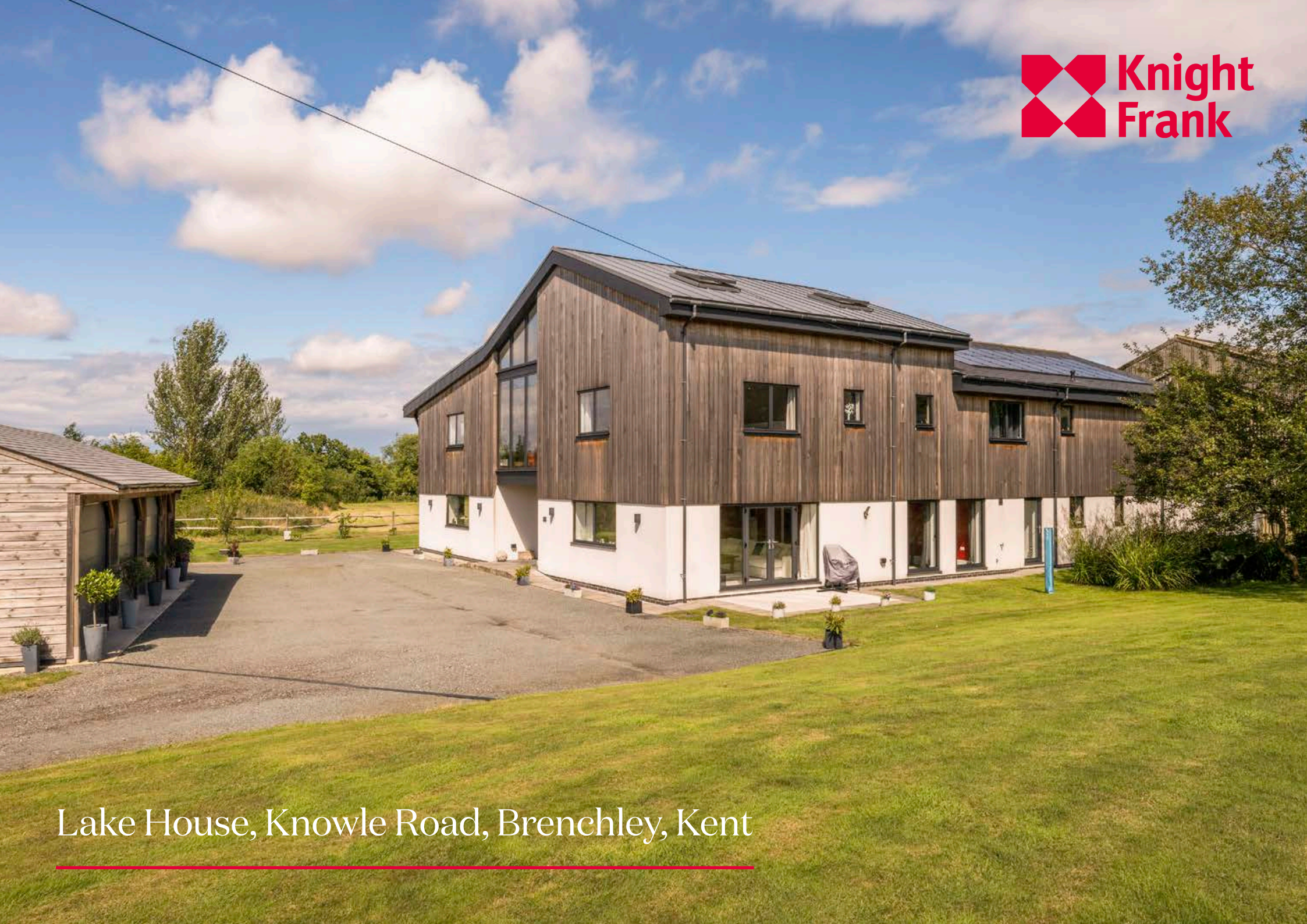
Lake House, Knowle Road, Brenchley, Kent