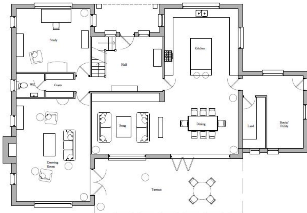
Ground Floor Plan (GIA 175.8m 2 )