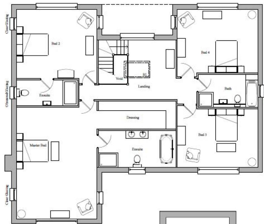
First Floor Plan (GIA 154.3m 2 )