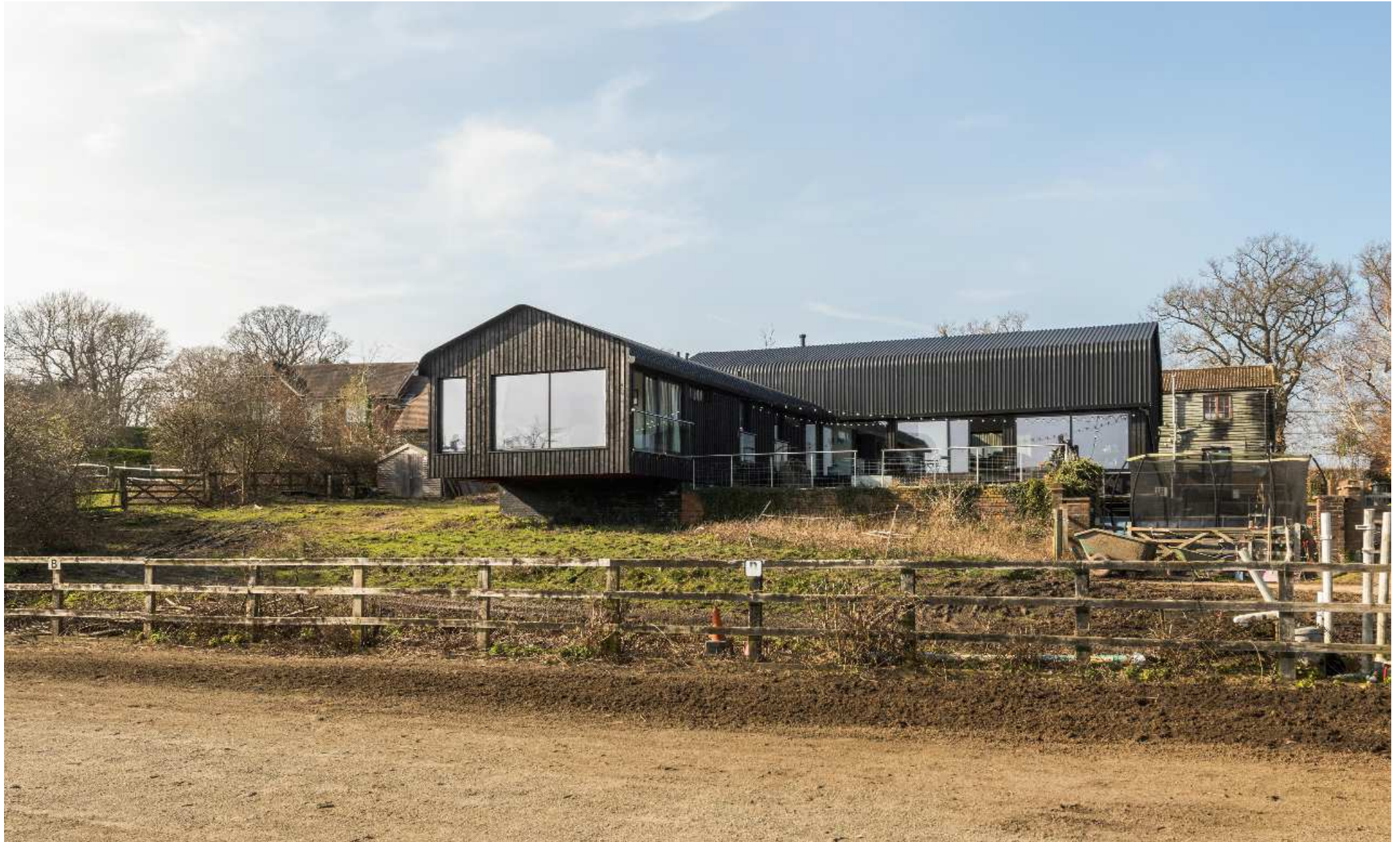
The Barn, Rushers Cross, Mayfield, East Sussex